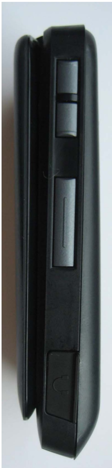
Figure 3-3. Button Side of radio