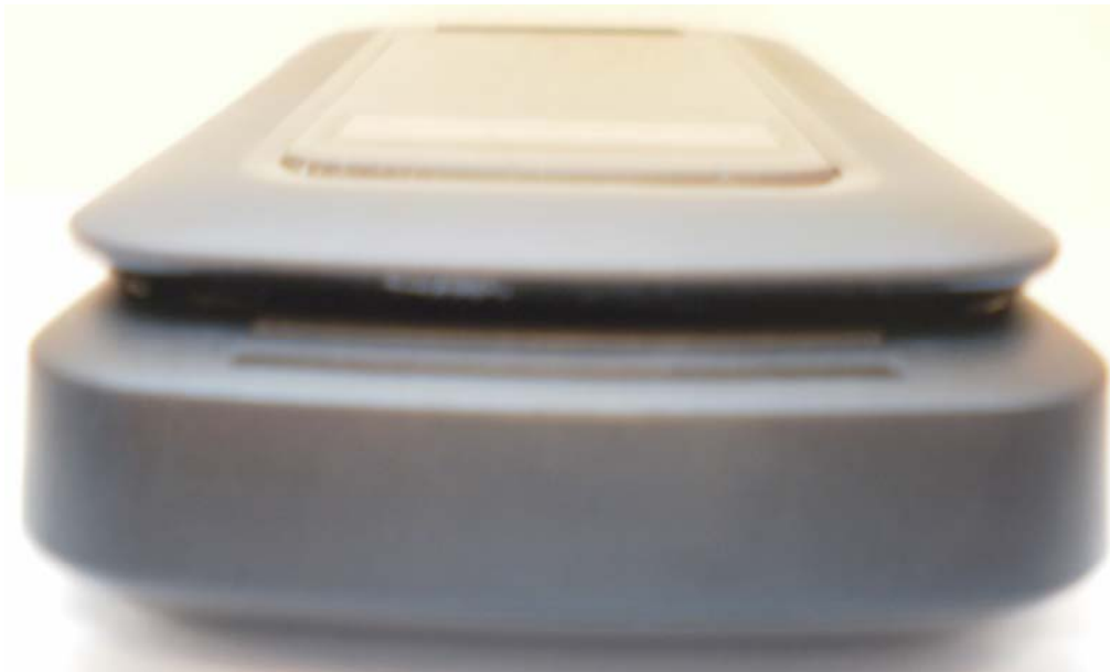
Figure 3-6. Bottom of radio