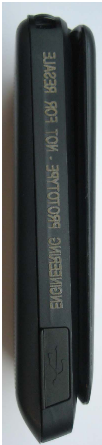
Figure 3-4. Opposite Side of radio