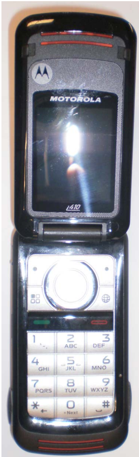
Figure 3-1. Front of radio (Flip Open)