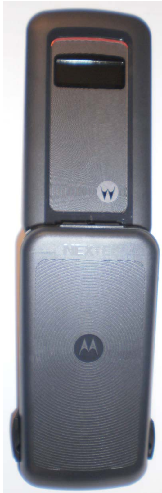
Figure 3-2. Back of radio (Flip Open)