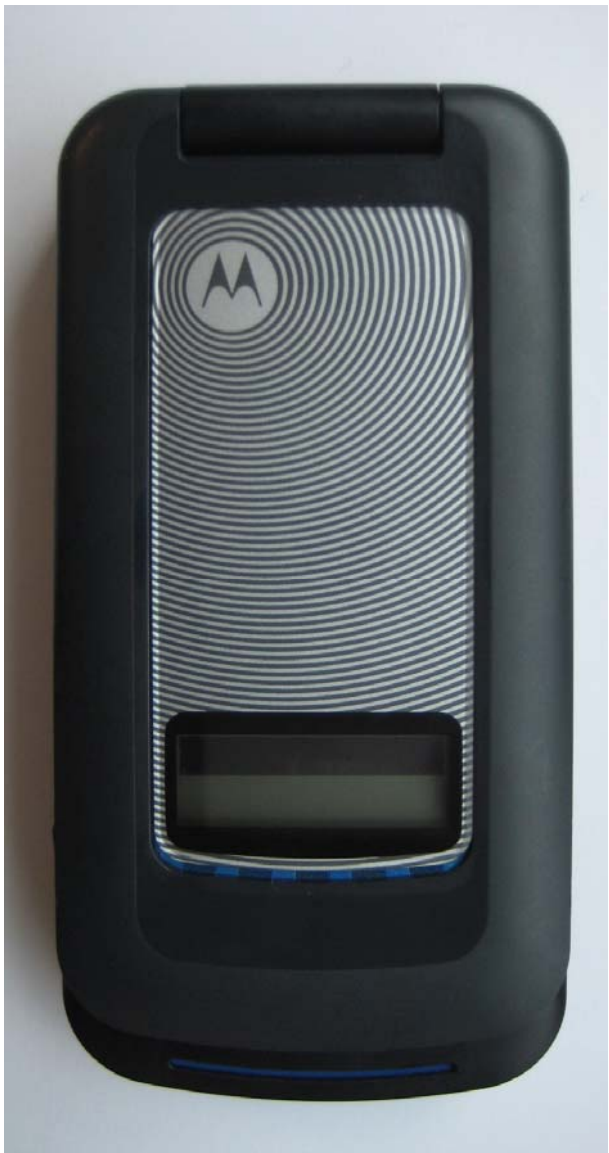
Figure 3-1. Front of radio (Flip Closed)

The radio product shapes, colors and housings/bezels may vary.