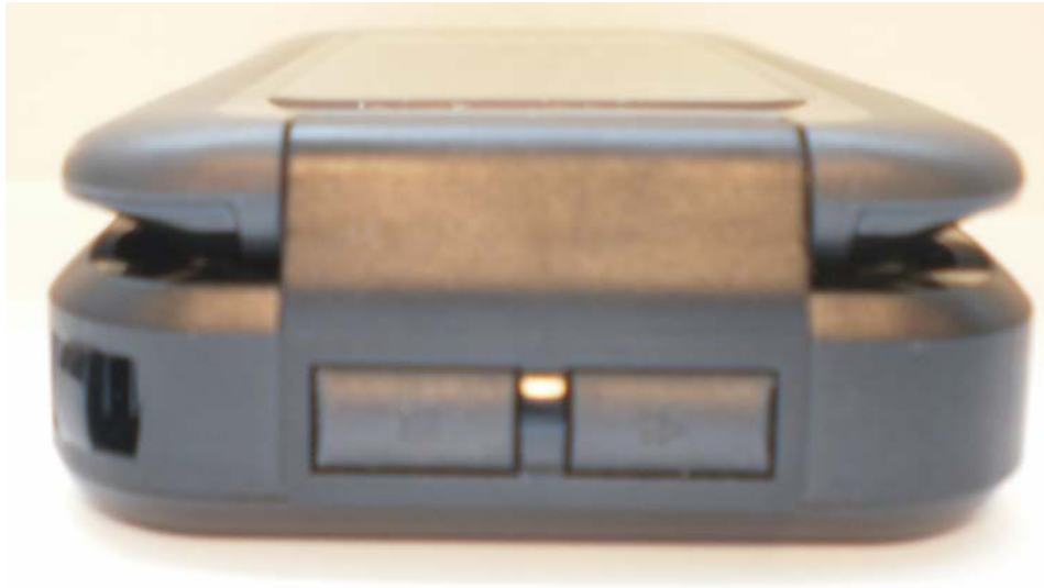
Figure 3-5. Top of radio