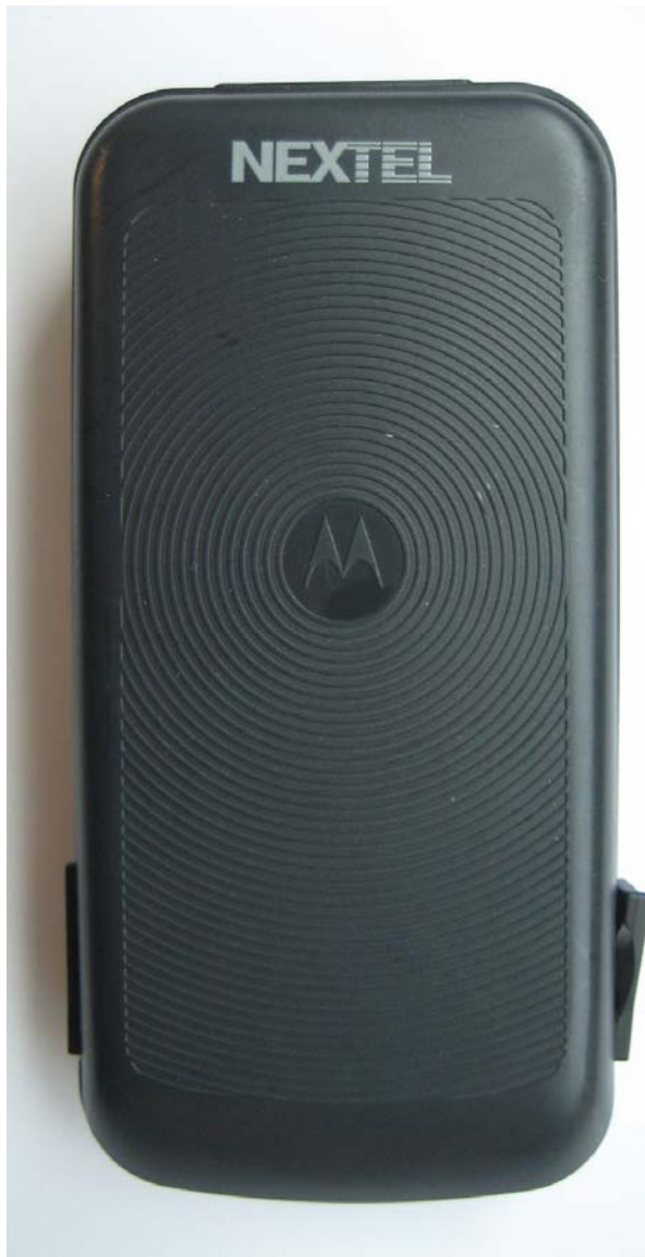
Figure 3-2. Back of radio (Flip Closed)