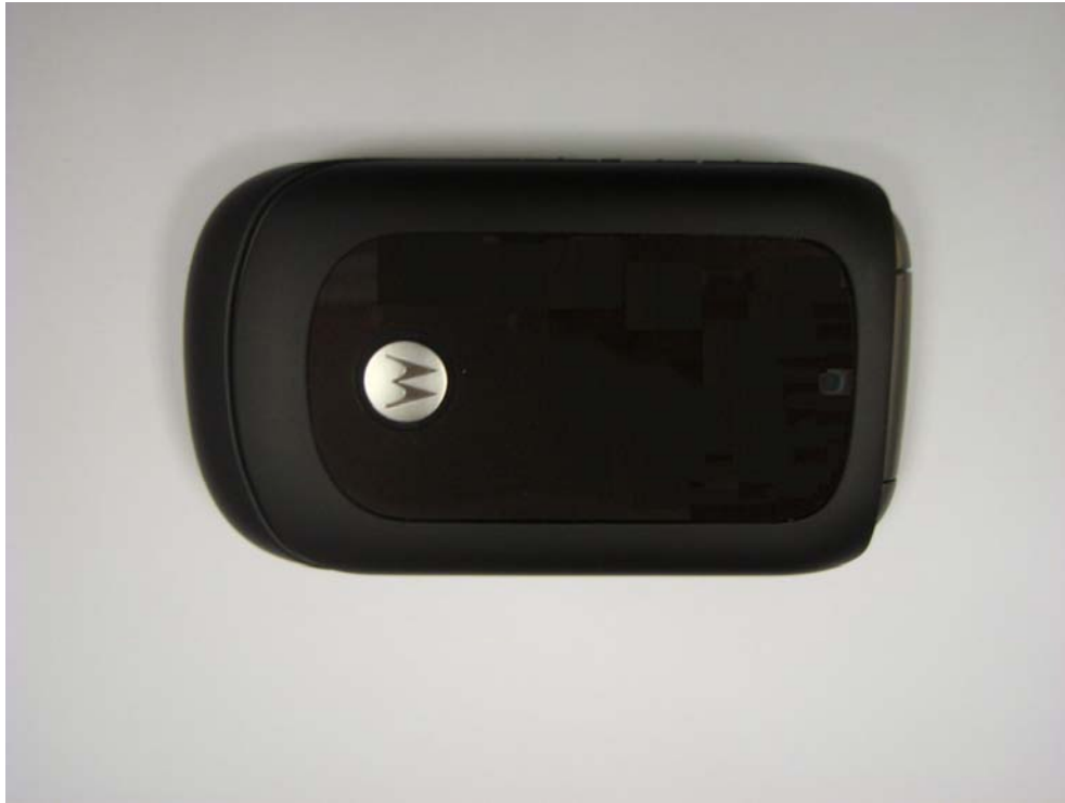
Figure 1. Phone Closed