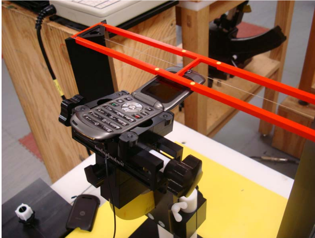
Figure 9. Positioning and Measurement for T-coil