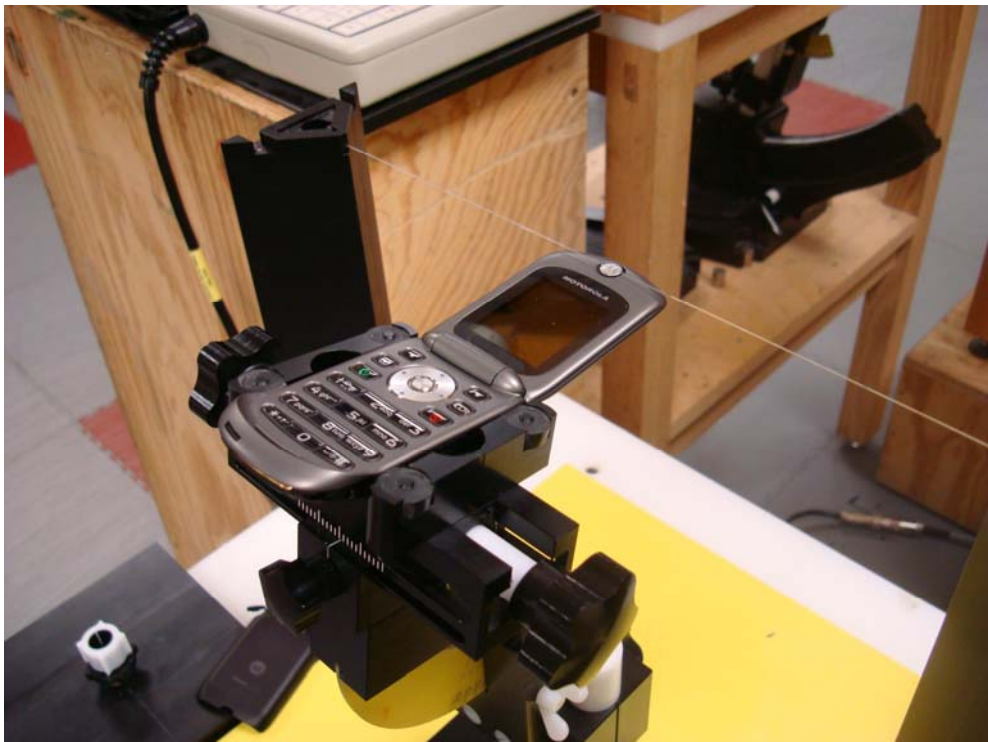
Figure 6. Measurement for RF Emissions