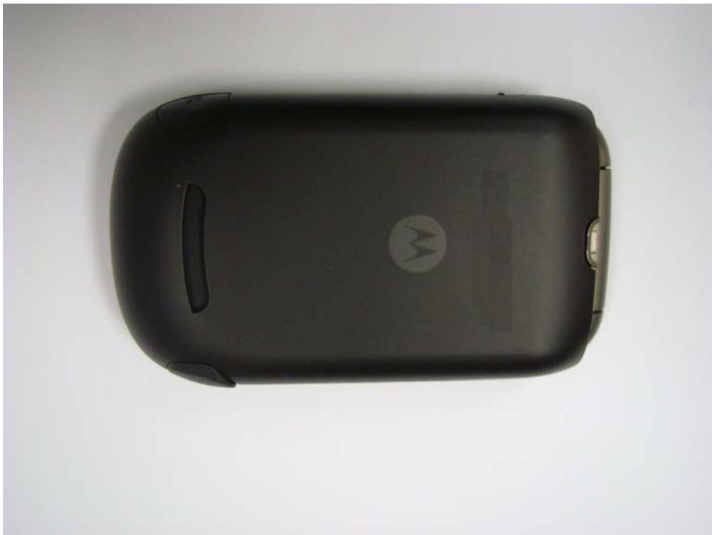
Figure 2. Phone Closed - Back View