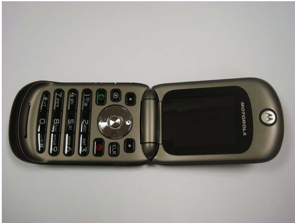
Figure 3. Phone Open