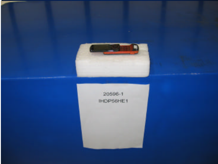
Radiated Emissions Z-Axis