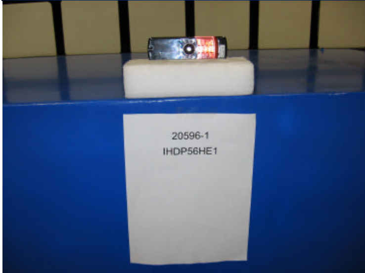
Radiated Emissions Y-Axis