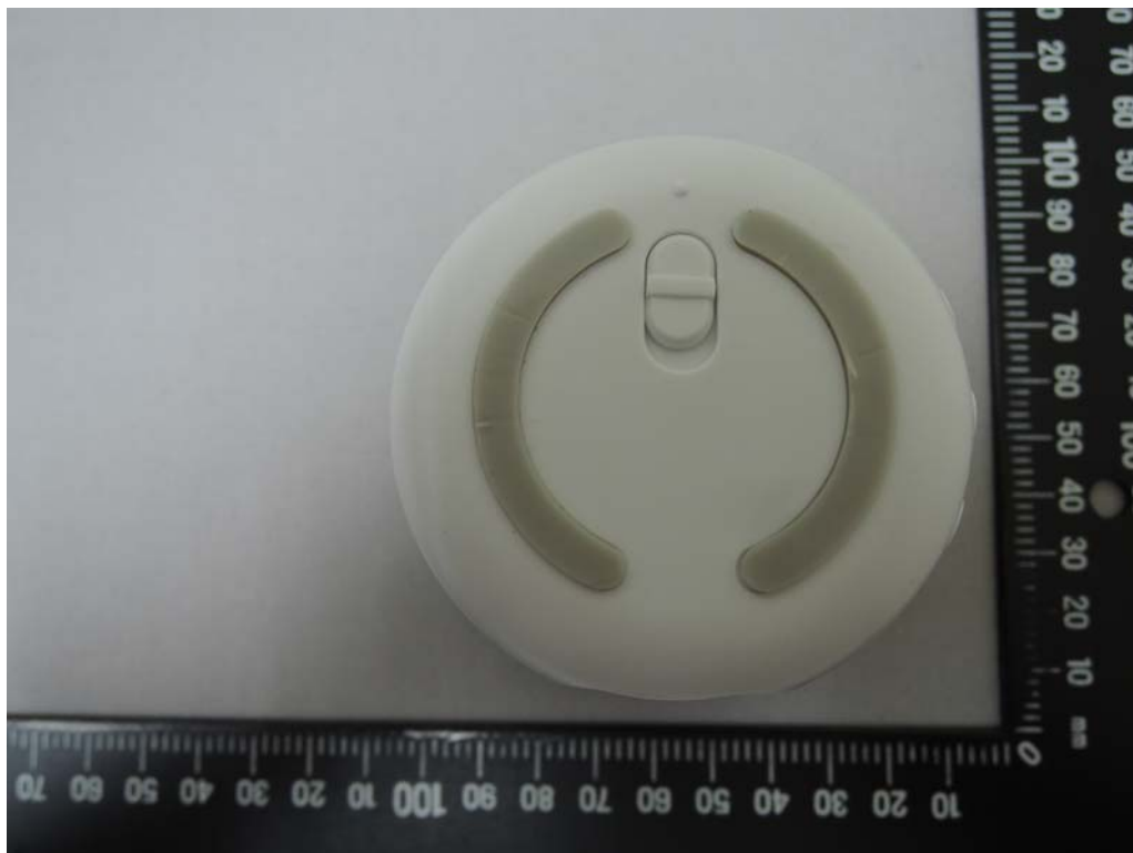
Side View of EUT - 1