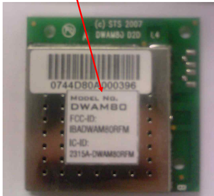
Physical Location of IC Label on EUT