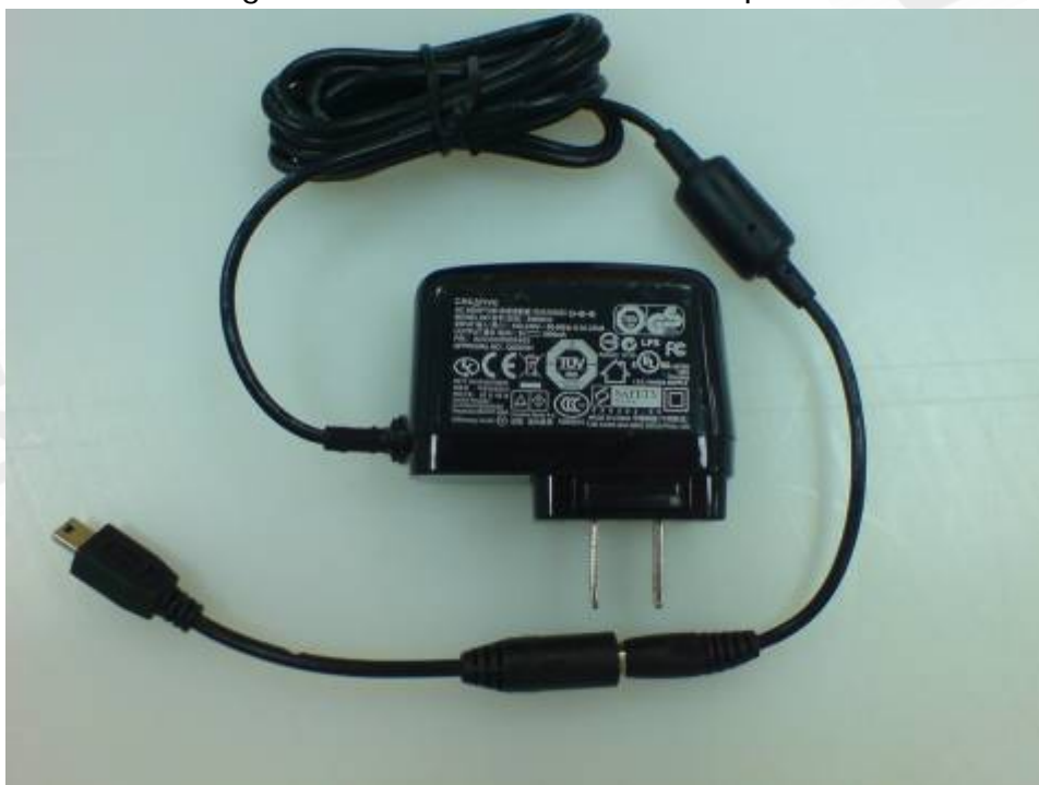
Fig.5 Adapter End of Report

Unless otherwise stated the results shown in this test report refer only to the sample(s) tested and such sample(s) are retained for 90 days only. This test report cannot be reproduced, except in full, without prior written permission of the Company. 除非另有說明，此報告結果僅對測試之樣品負責，同時此樣品僅保留90天。本報告未經本公司書面許可，不可部份複製。