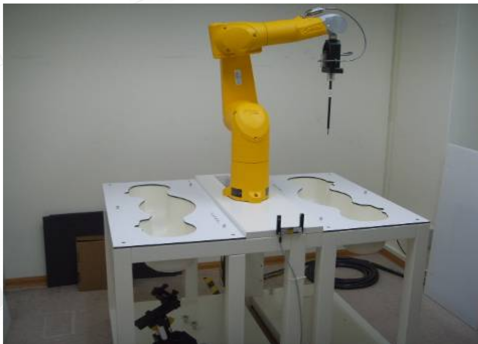
Fig.1 Photograph of the SAR measurement System