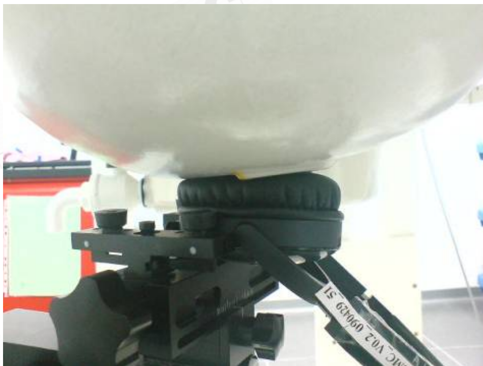
Fig.3.1 Left Head Section / Cheek-Touch Position