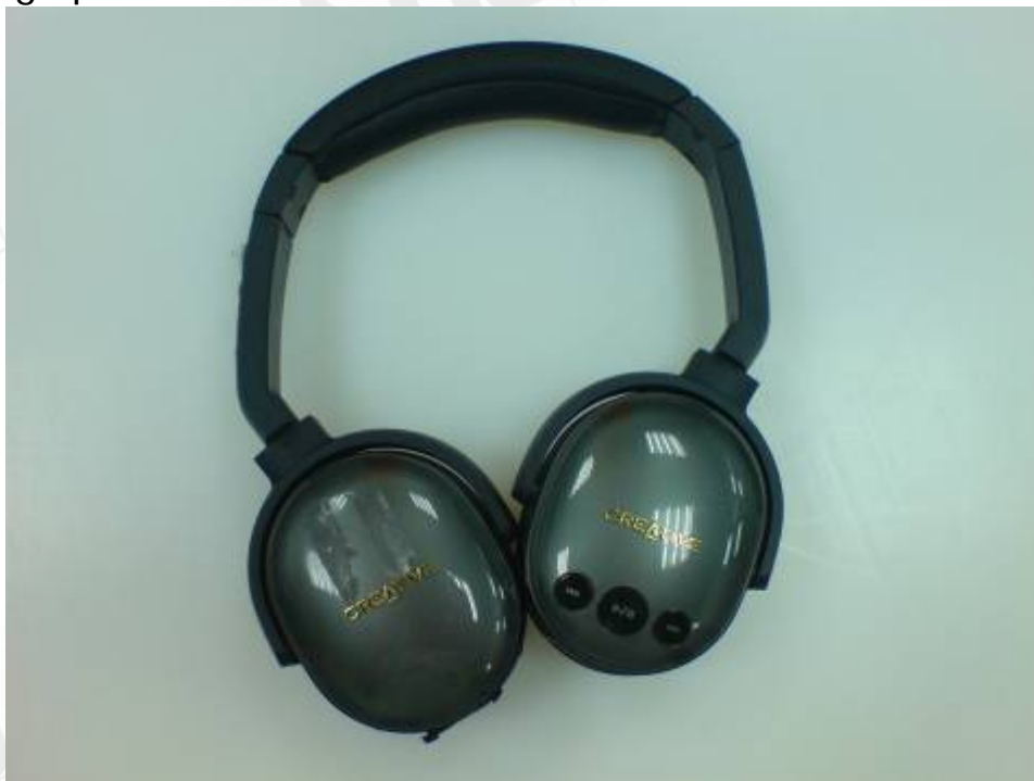
Fig.4 Sound Blaster Wireless Headphone