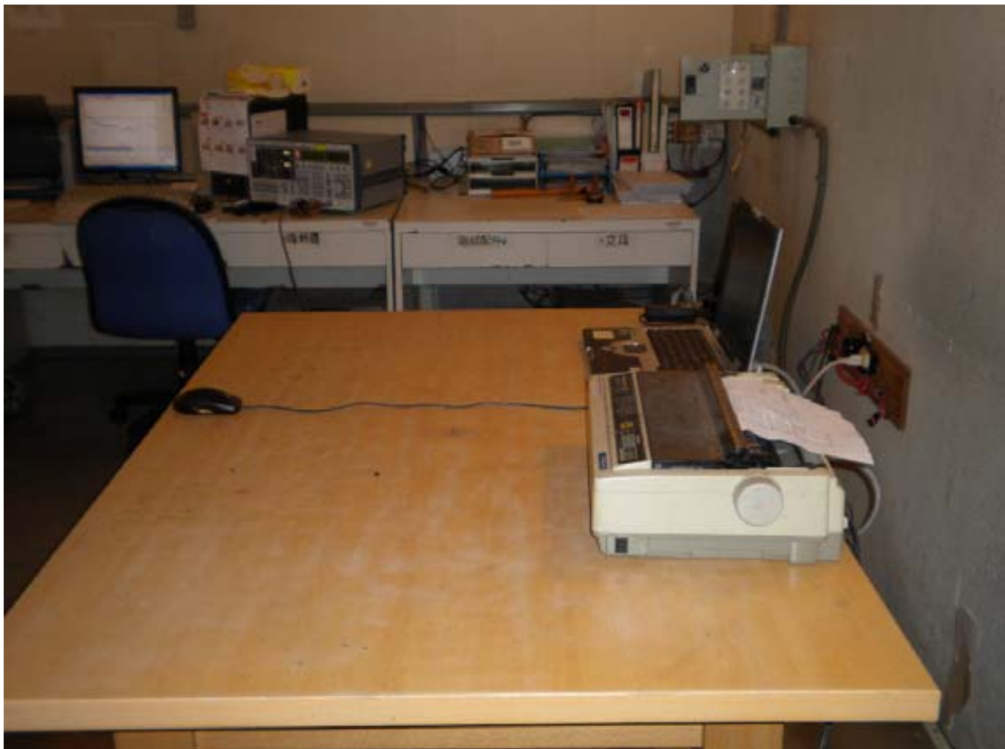
BACK VIEW OF CONDUCTED MEASUREMENT