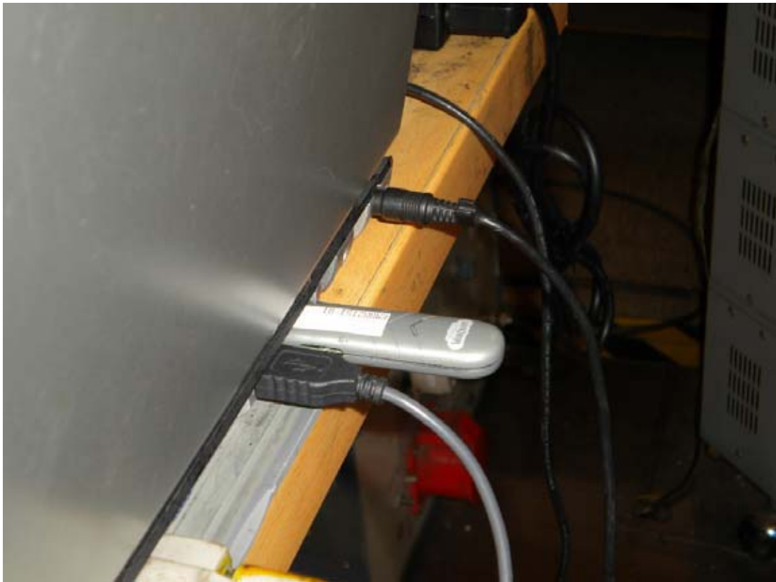
PHOTO VIEW OF EUT