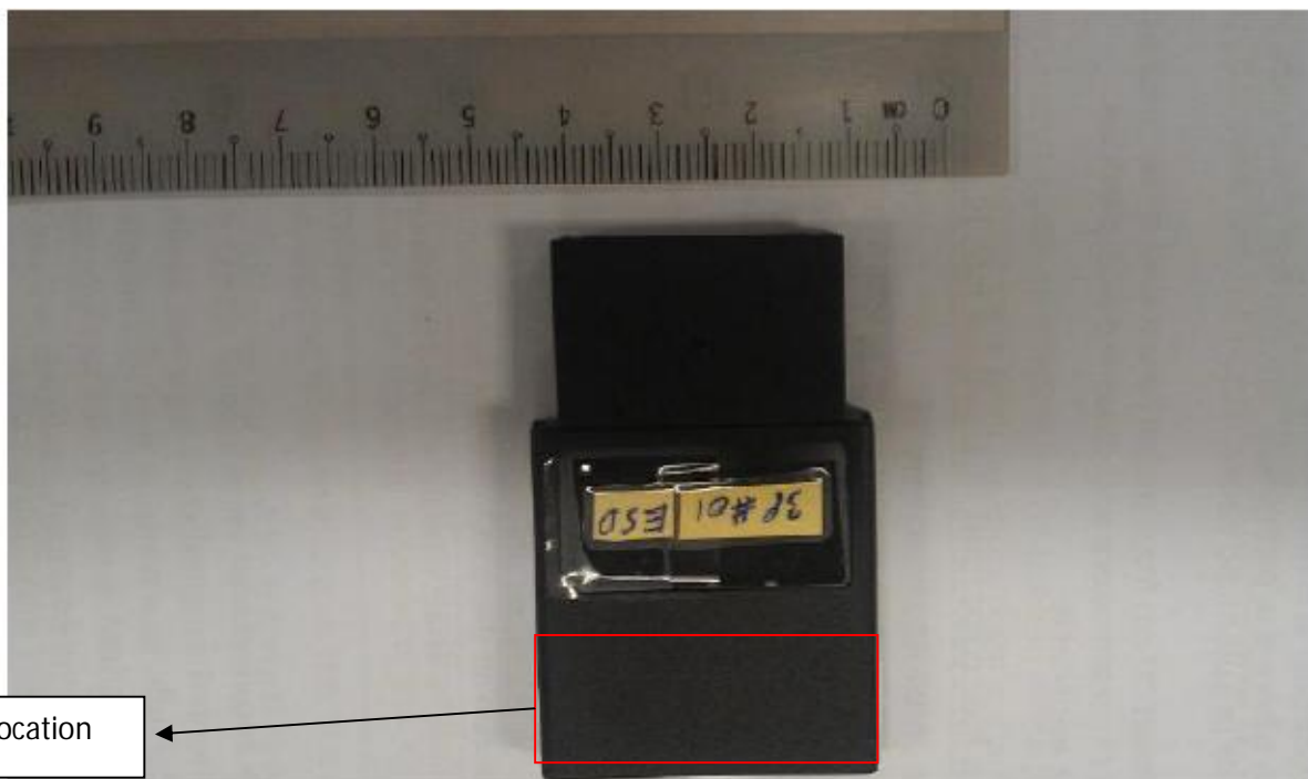
External Top View