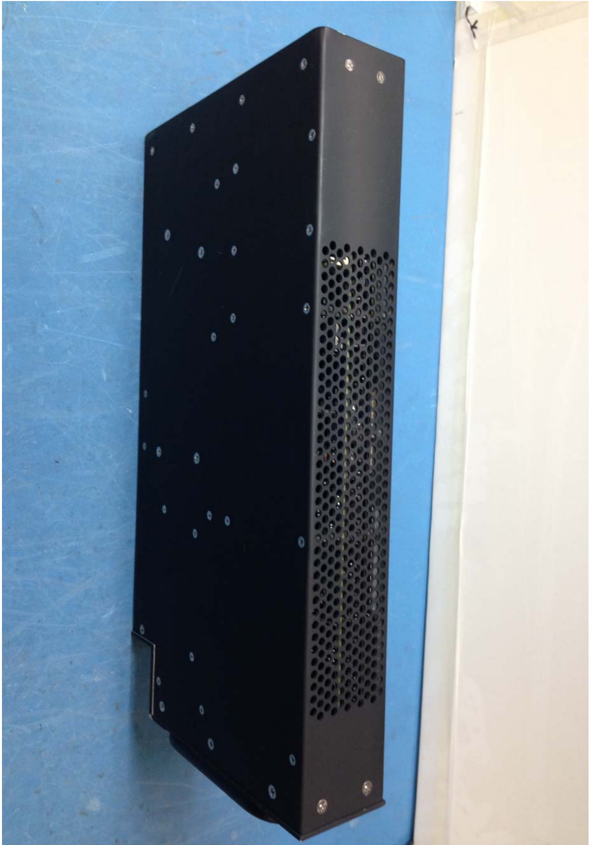
Figure 8: Top-side View