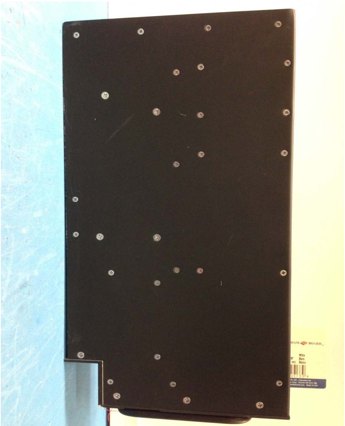
Figure 4: Side View