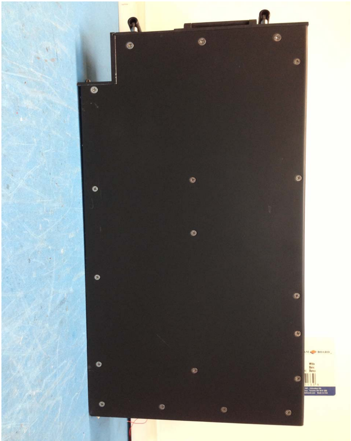
Figure 5: Side View