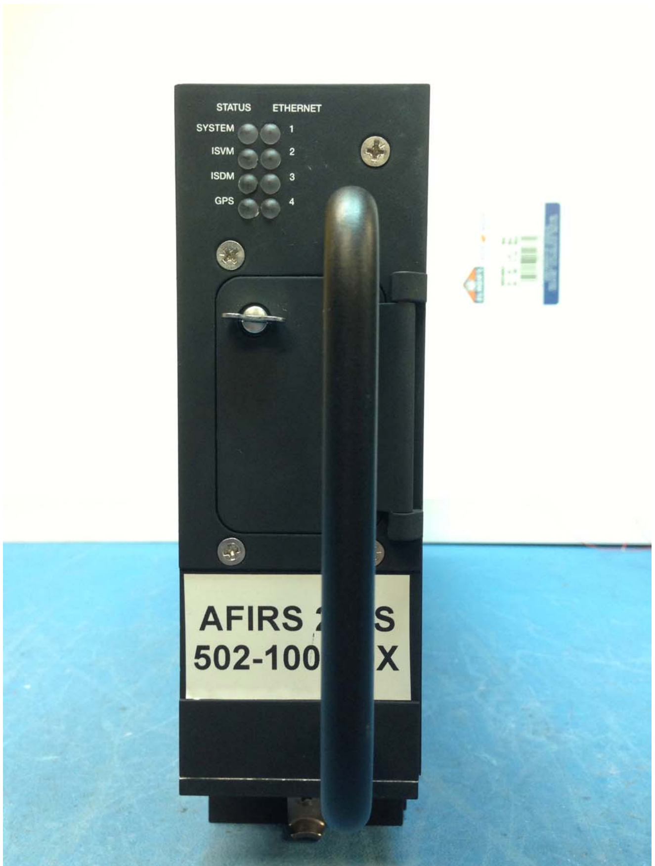
Figure 2: Front View