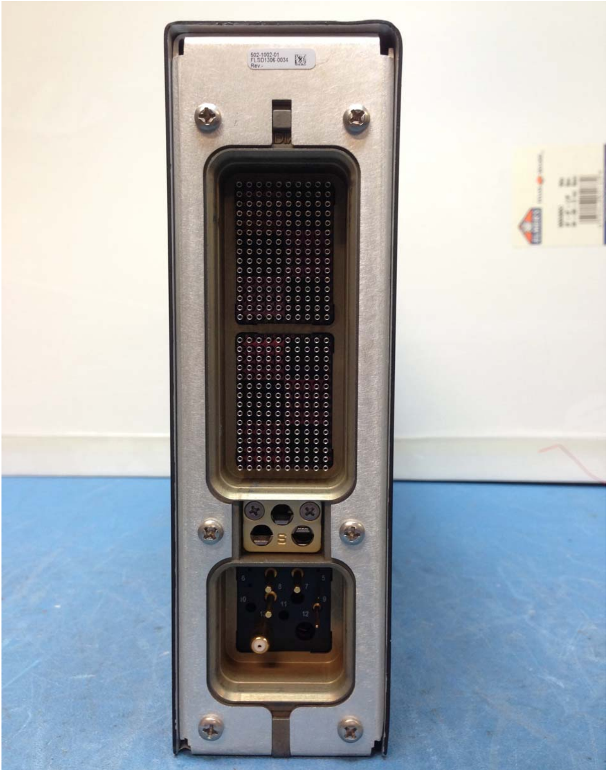
Figure 6: Rear View