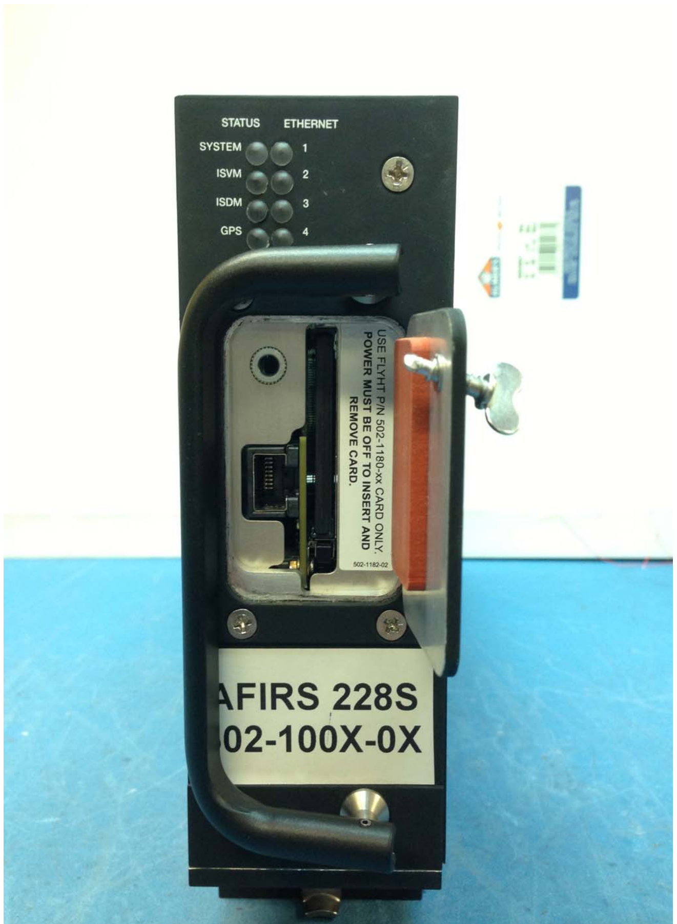
Figure 3: Front View