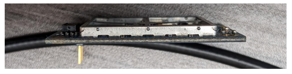
Figure 3 XPD2400 board's side view with shield lid removed.