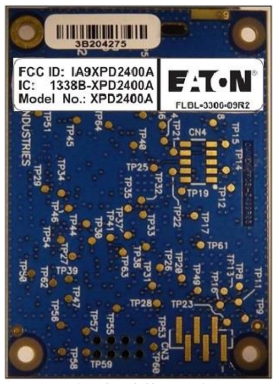
Figure 2 XPD2400 Bottom view.