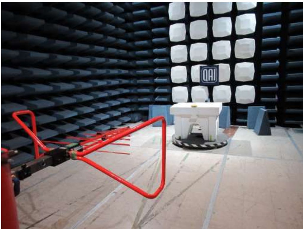
Figure 2: Radiated Emissions 30MHz – 1GHz