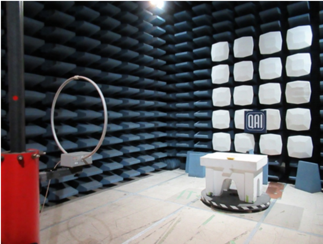
Figure 1: Radiated Emissions performed at the 3m SAC, 10kHz – 30MHz