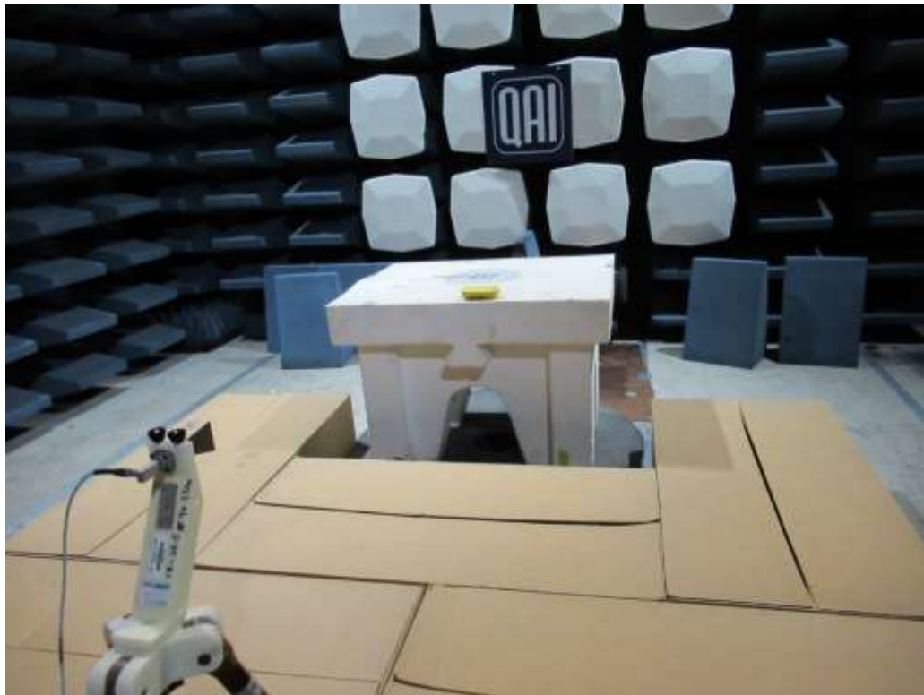
Figure 4: Radiated Emissions 18GHz to 26 GHz