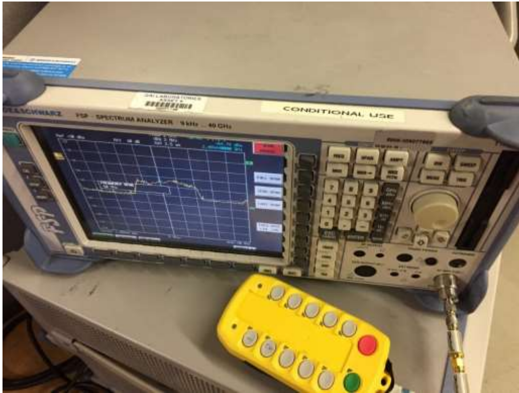
Figure 5: Radio Testing Station