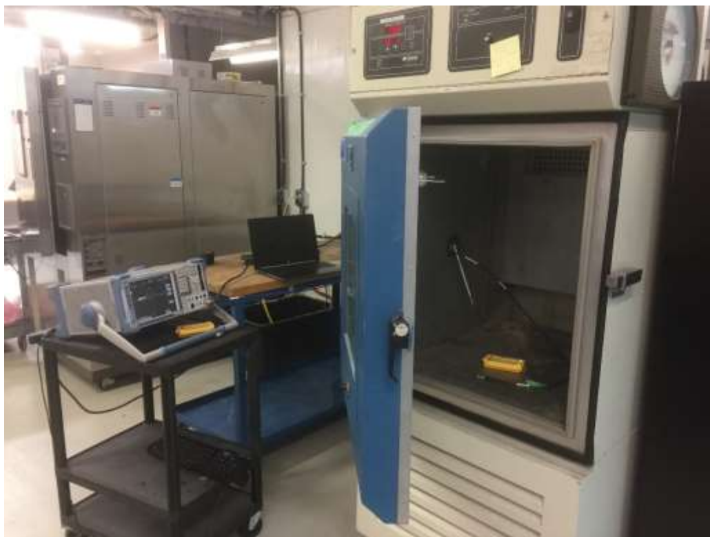
Figure 7: Frequency Stability Testing