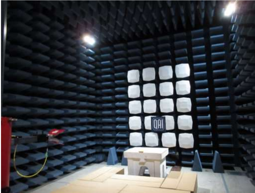
Figure 3: Radiated Emissions 1GHz to 18 GHz