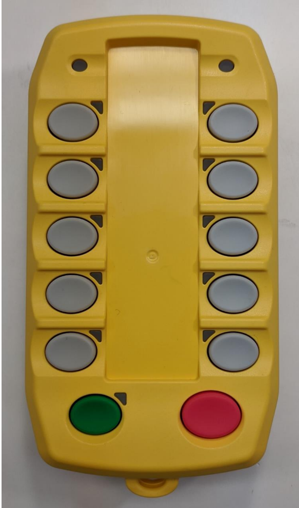
Figure 1 TD110-2.4 GHz Front Picture