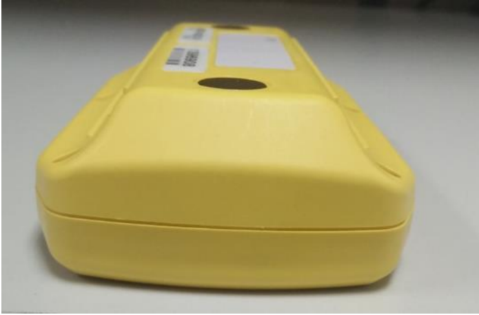
Figure 6Top View.