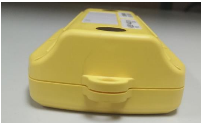
Figure 5 Bottom View.