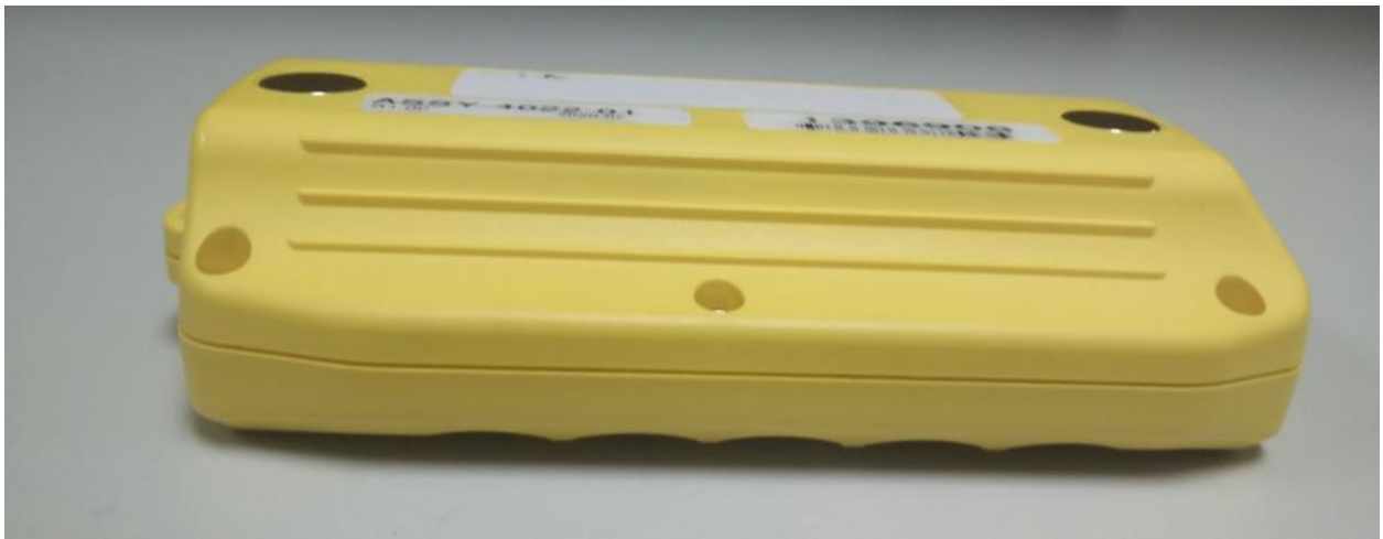
Figure 4 Right side view.