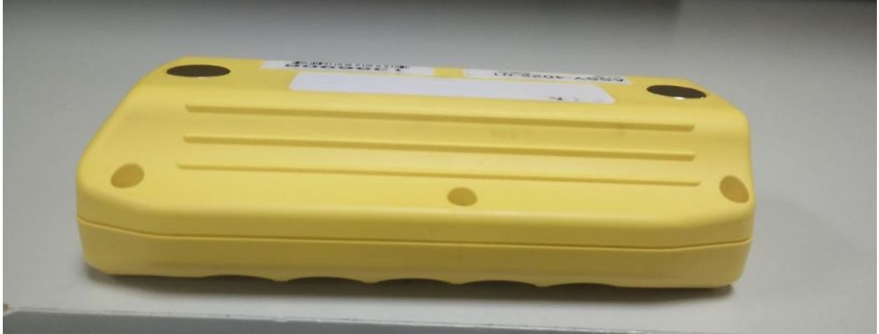
Figure 3 Left Side View.