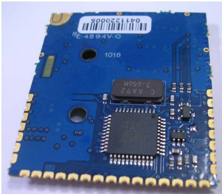
Figure 3 – Bottom Side of Transmitter