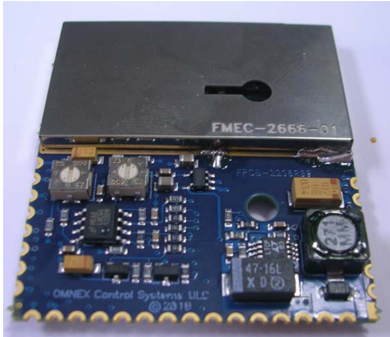
Figure 2 – Shield Side of Transmitter