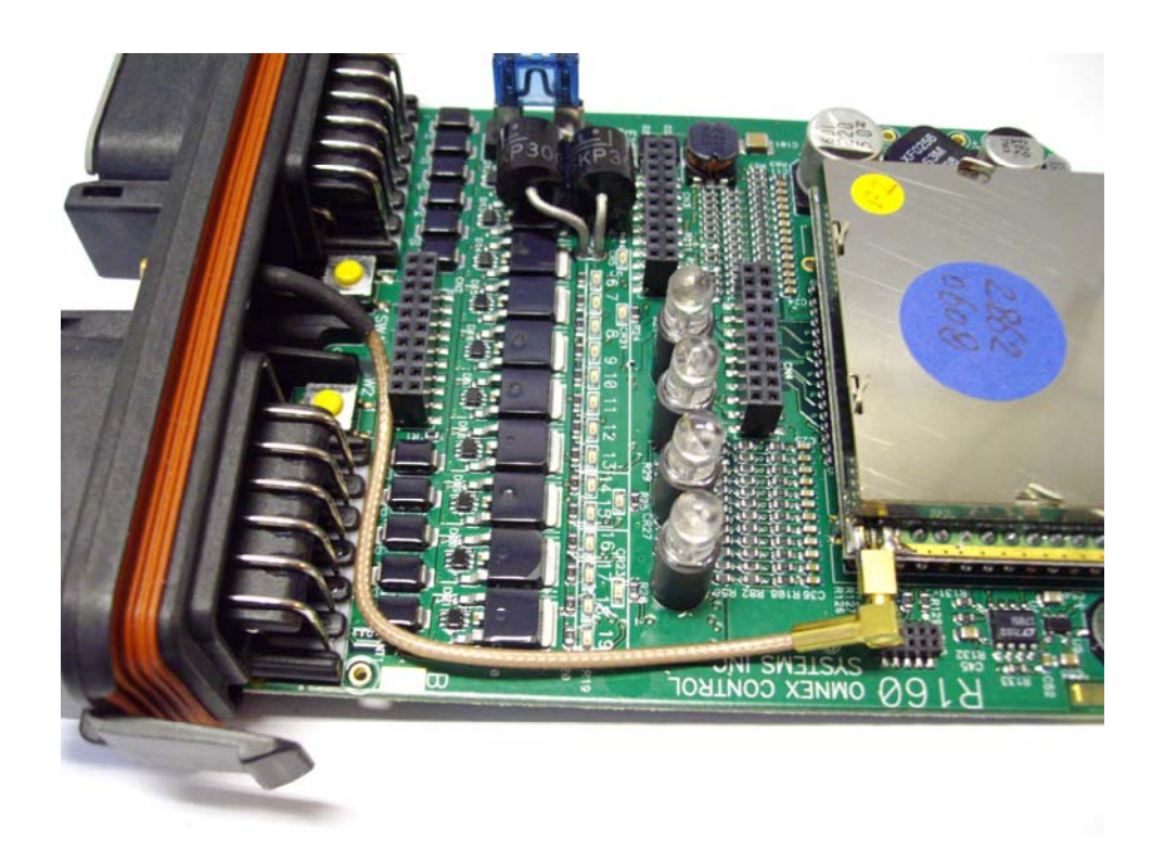
Page 57 of 61

This document shall not be reproduced or utilized in any form or by any means, electronic or mechanical, including photocopying and microfilm, without permission in writing from LabTest Certification Inc.