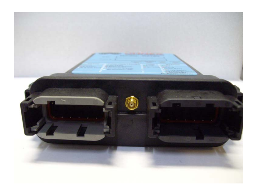
Page 58 of 61

This document shall not be reproduced or utilized in any form or by any means, electronic or mechanical, including photocopying and microfilm, without permission in writing from LabTest Certification Inc.