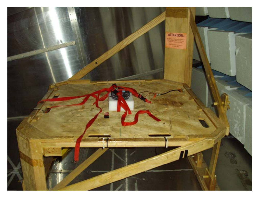
Page 60 of 61

This document shall not be reproduced or utilized in any form or by any means, electronic or mechanical, including photocopying and microfilm, without permission in writing from LabTest Certification Inc.