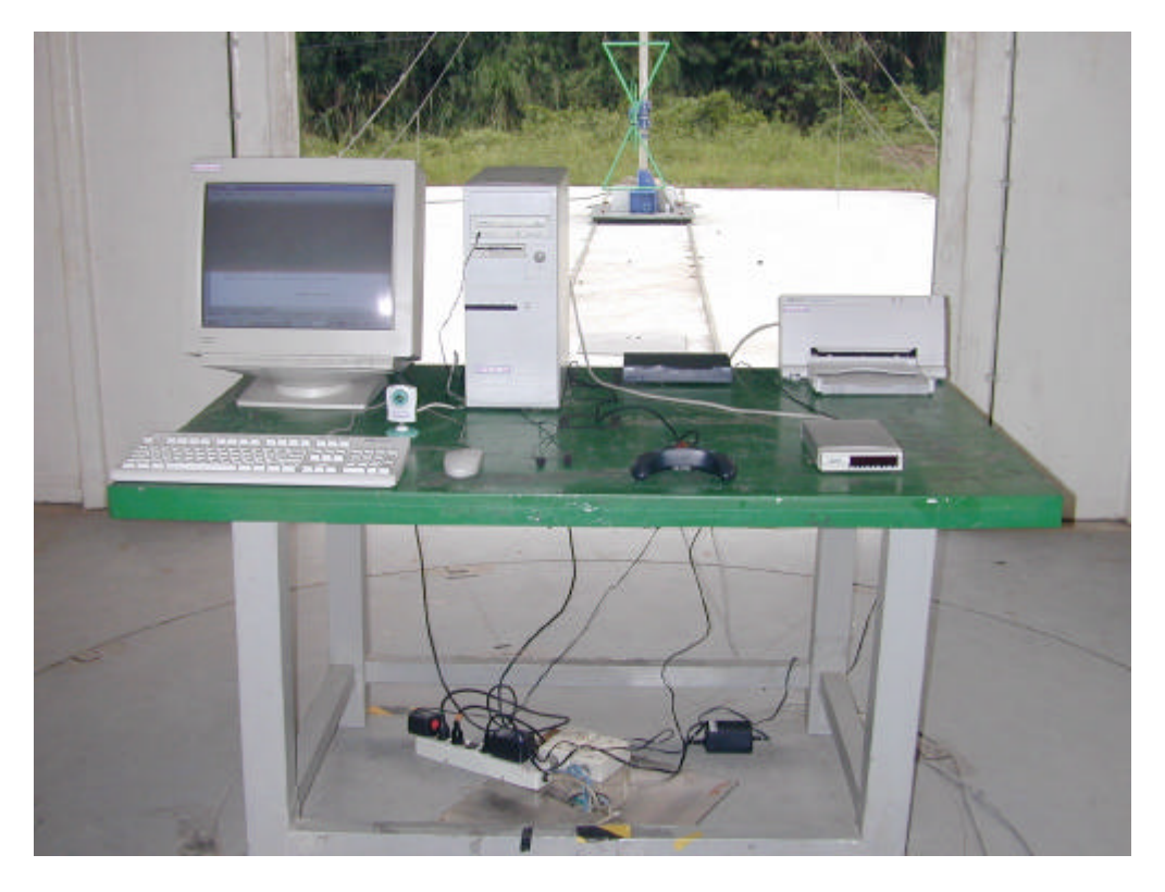
Back View of Radiated Test