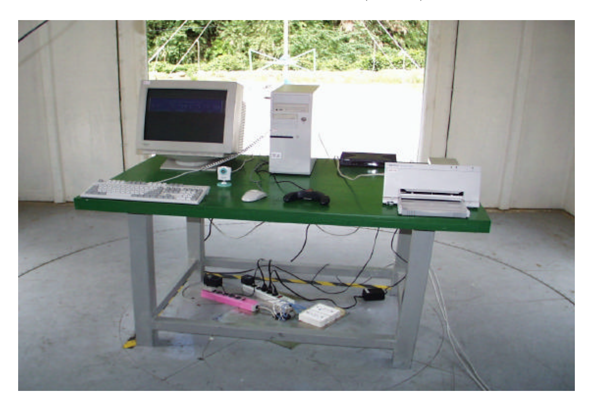
Back View of Conducted Test ( Mode 1)