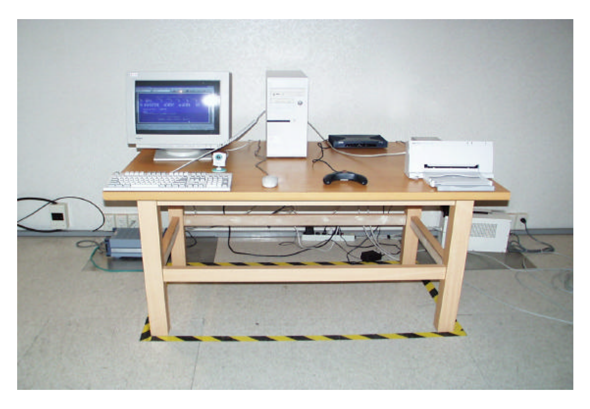
Back View of Conducted Test ( Mode 1)