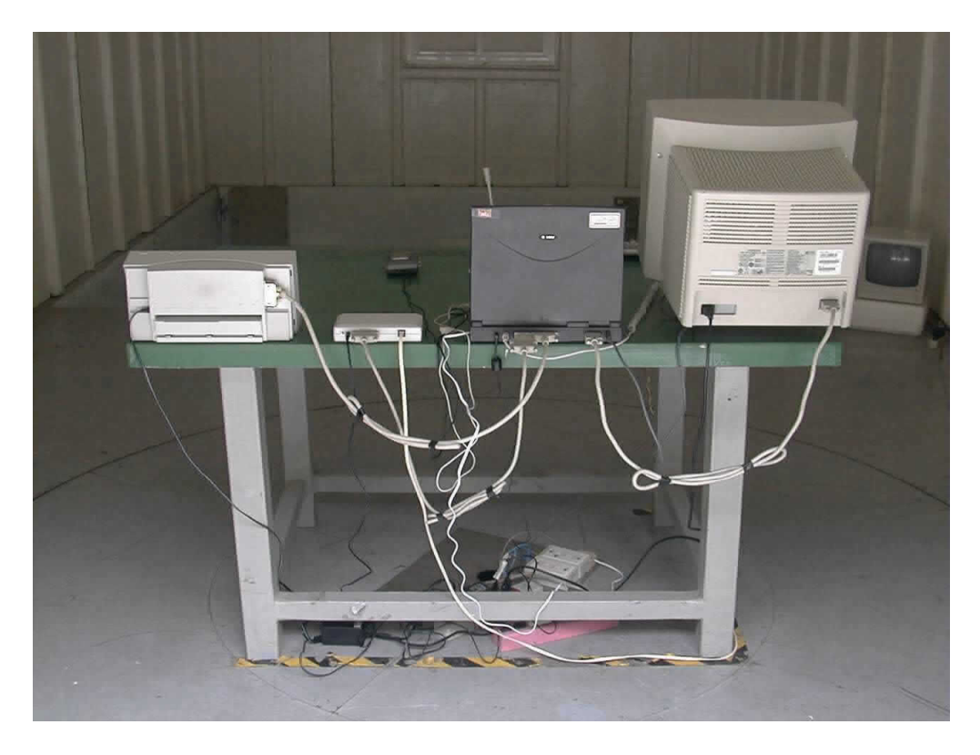
Back View of Radiated Test (Mode 1)

FCC Report No.: 99CH001FI Accredited Lab. of NVLAP(NIST) NVLAP Lab. Code : 200347-0