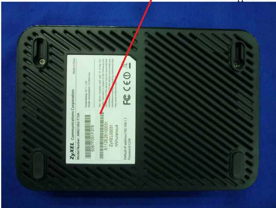
Figure 4 General Appearance of the EUT