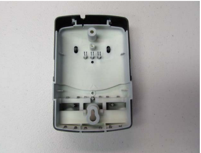
Figure 2: Back without PCB