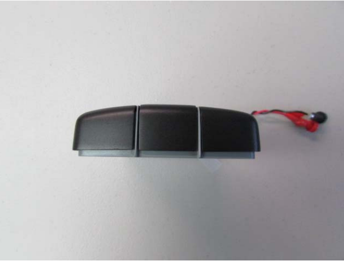
Figure 5: Bottom