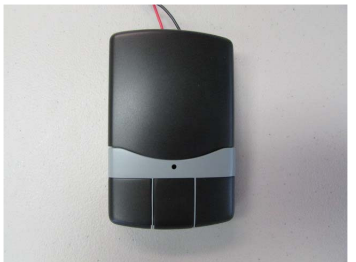
Figure 1: Front