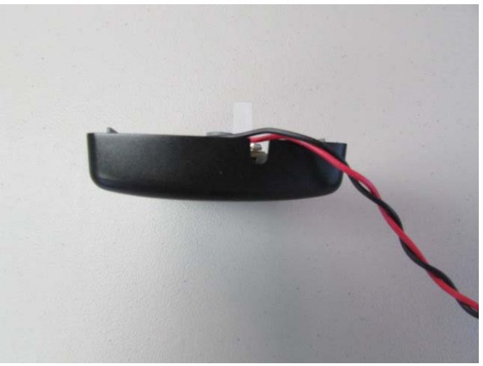
Figure 4: Top