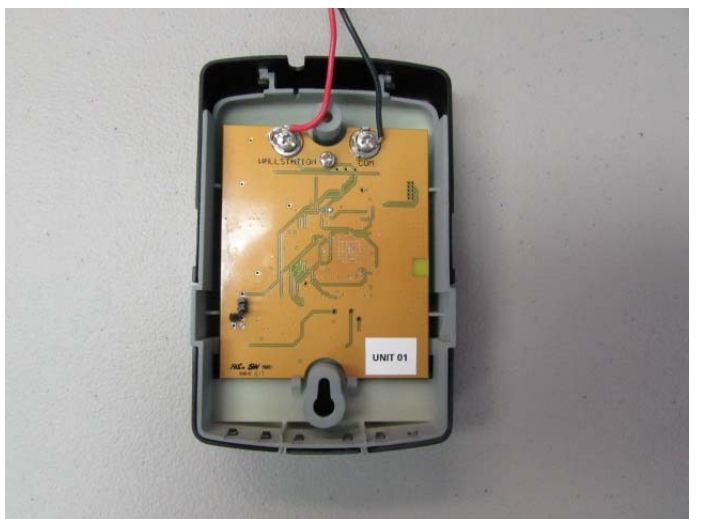
Figure 3: Back with PCB