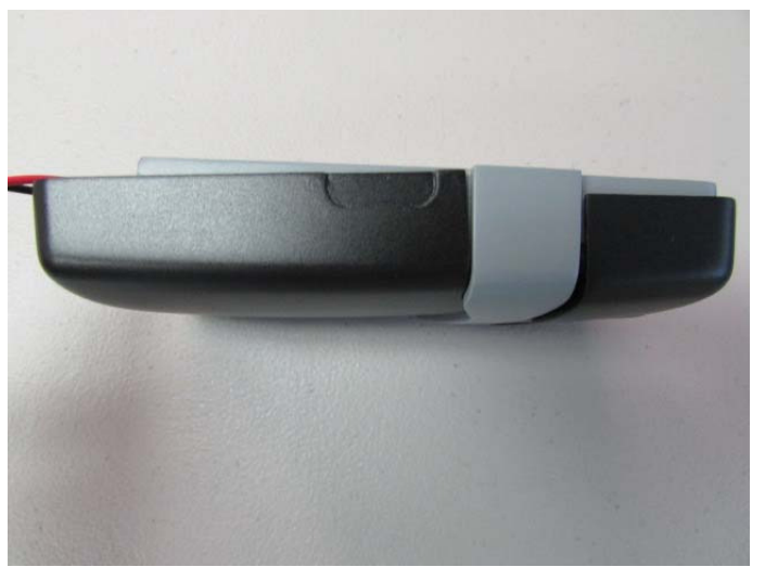
Figure 7: Left Side