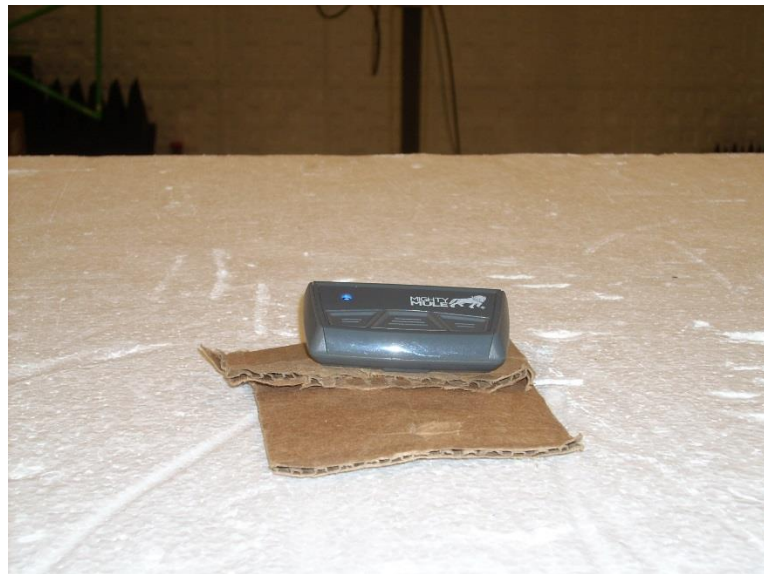
(3) Orthogonal positions