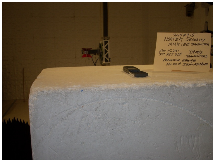
Rear View (1 – 3.3) GHz