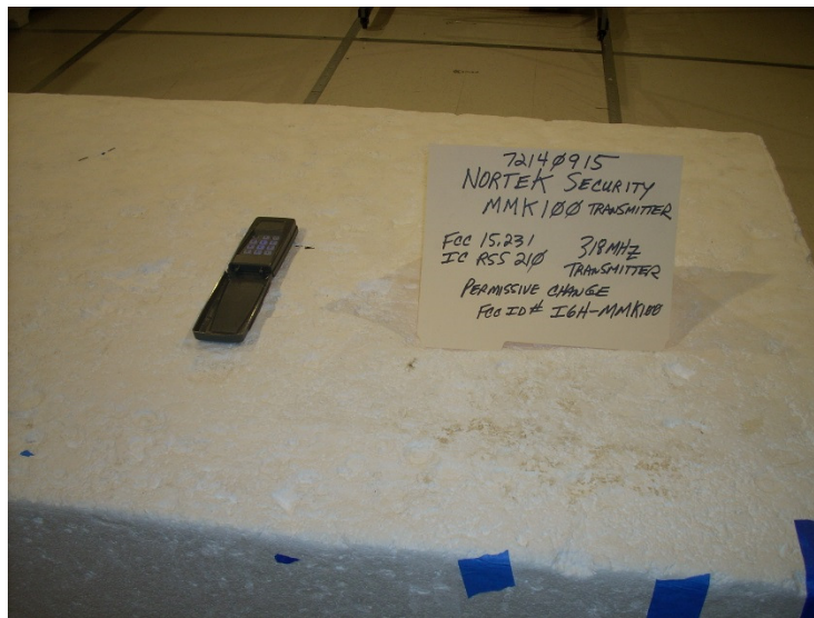
Rear View (30 – 1,000) MHz