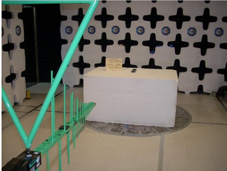
Front View (30 – 1,000) MHz