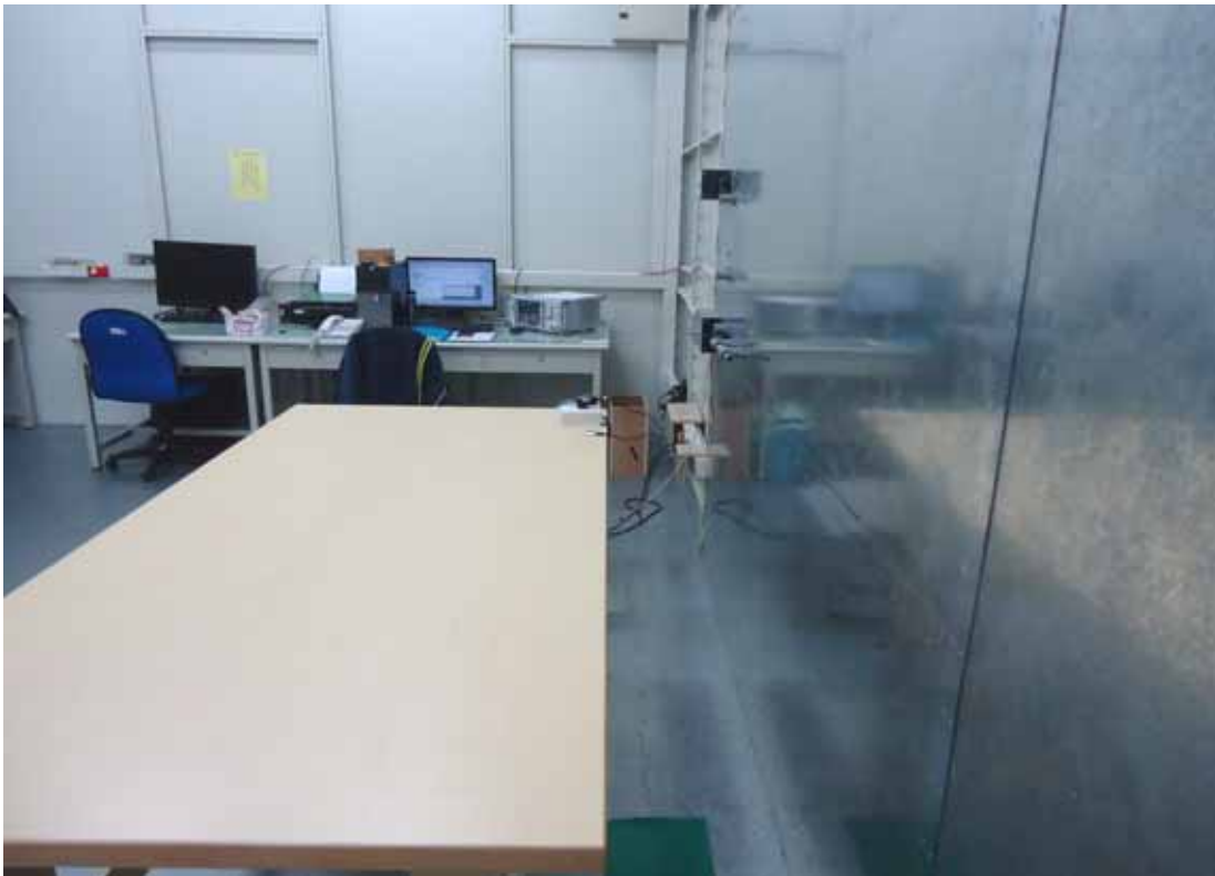
BACK VIEW OF CONDUCTED MEASUREMENT