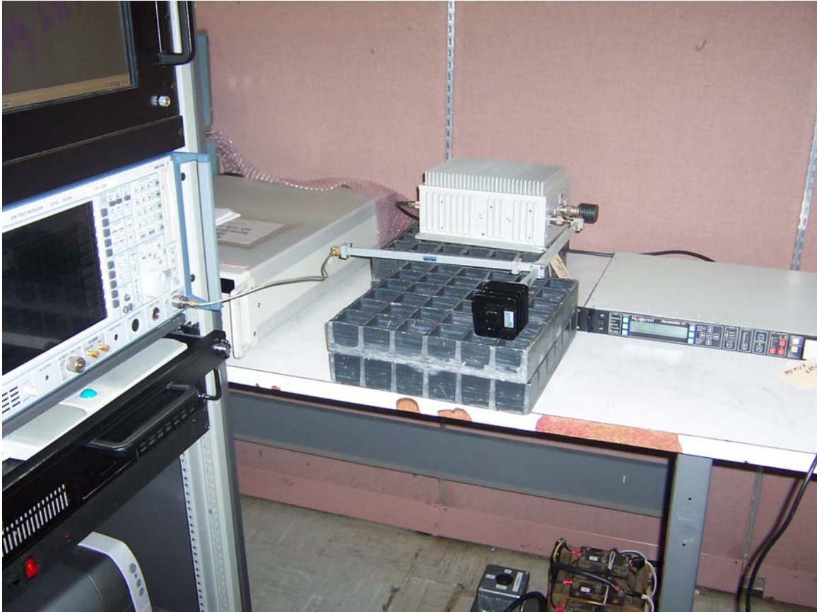
Antenna Conducted Emissions 18 GHz to 40 GHz