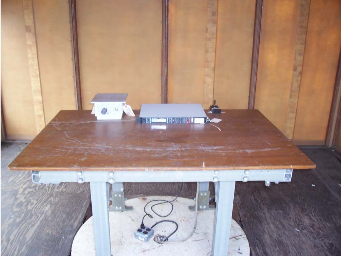
Spurious Emissions Setup Front