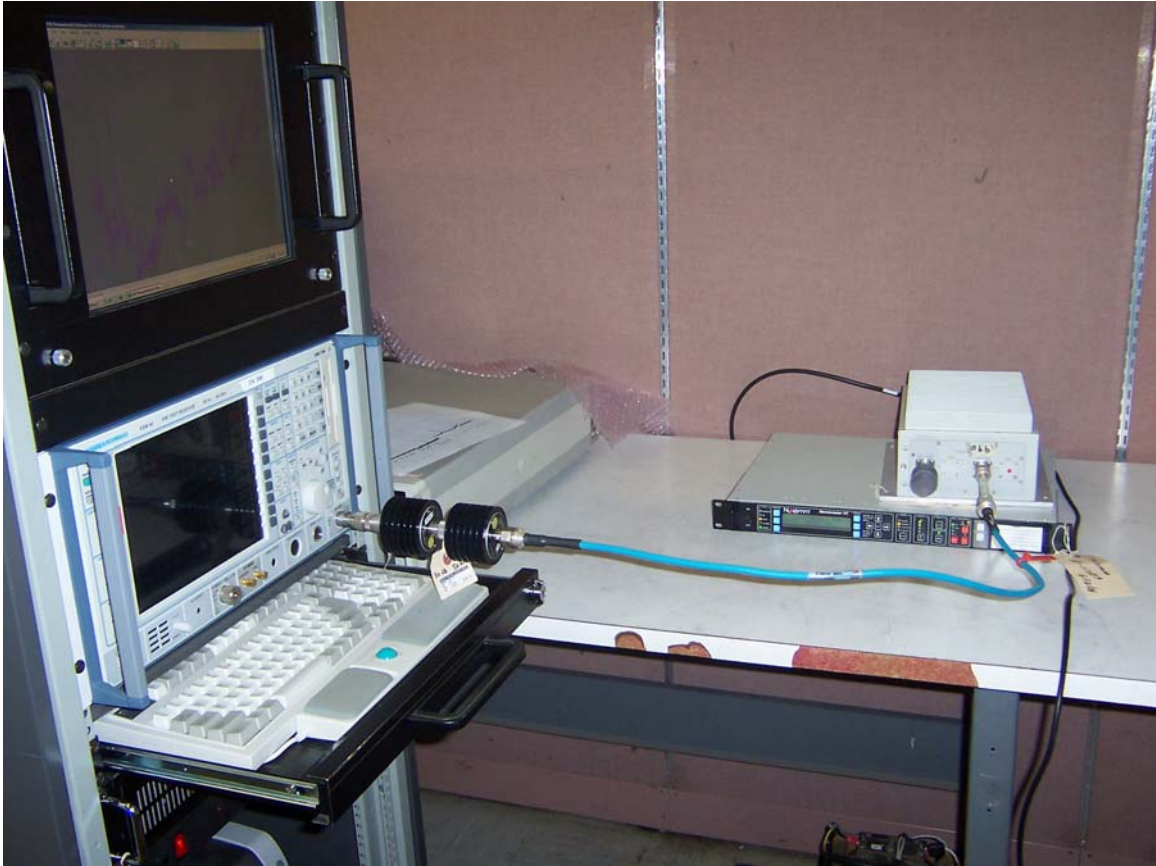
Antenna Conducted Emissions 30 MHz to 18 GHz