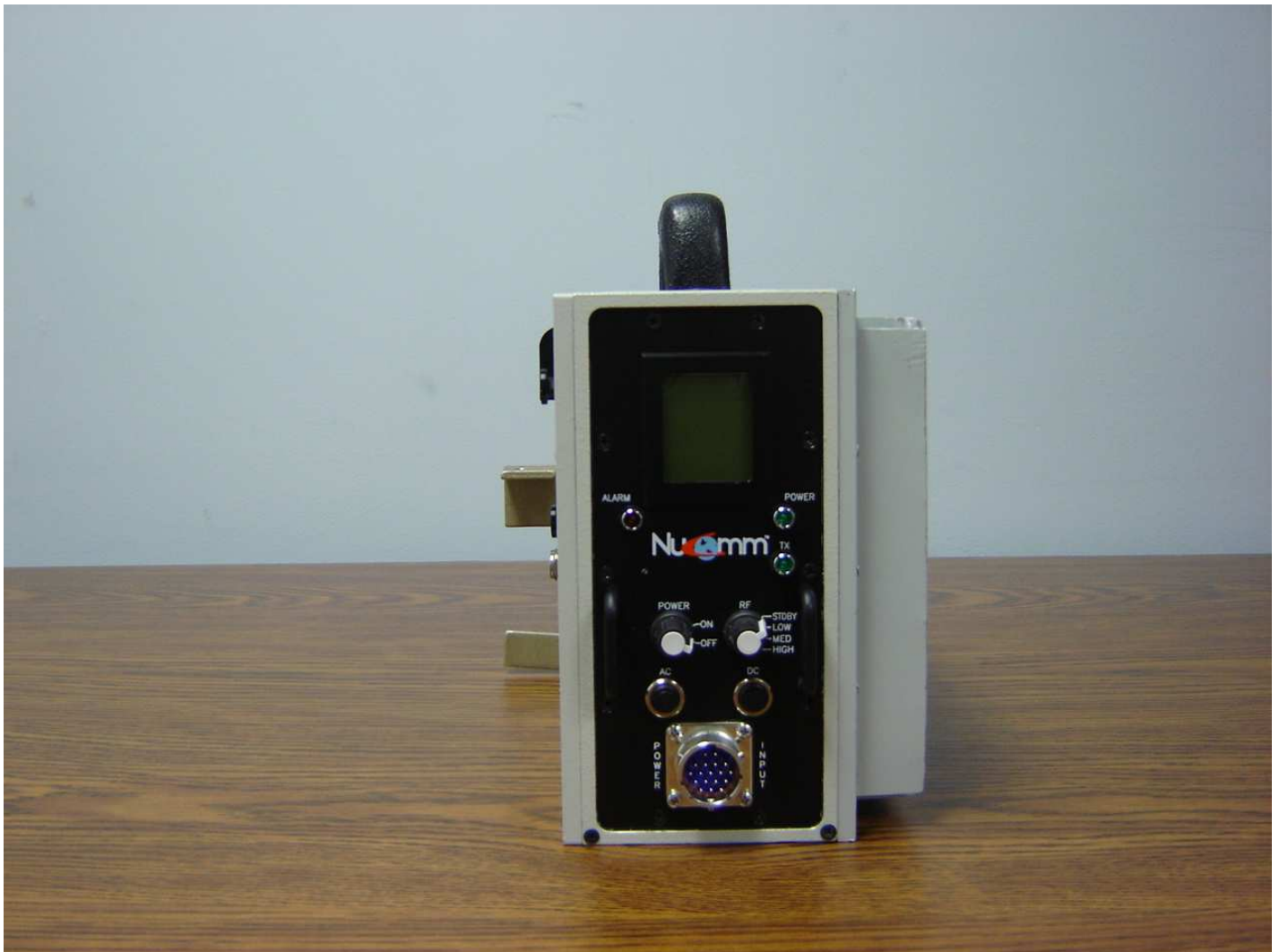
Figure 1: Front of Unit