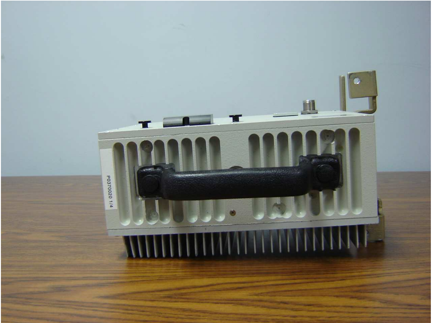
Figure 5: Top of Unit