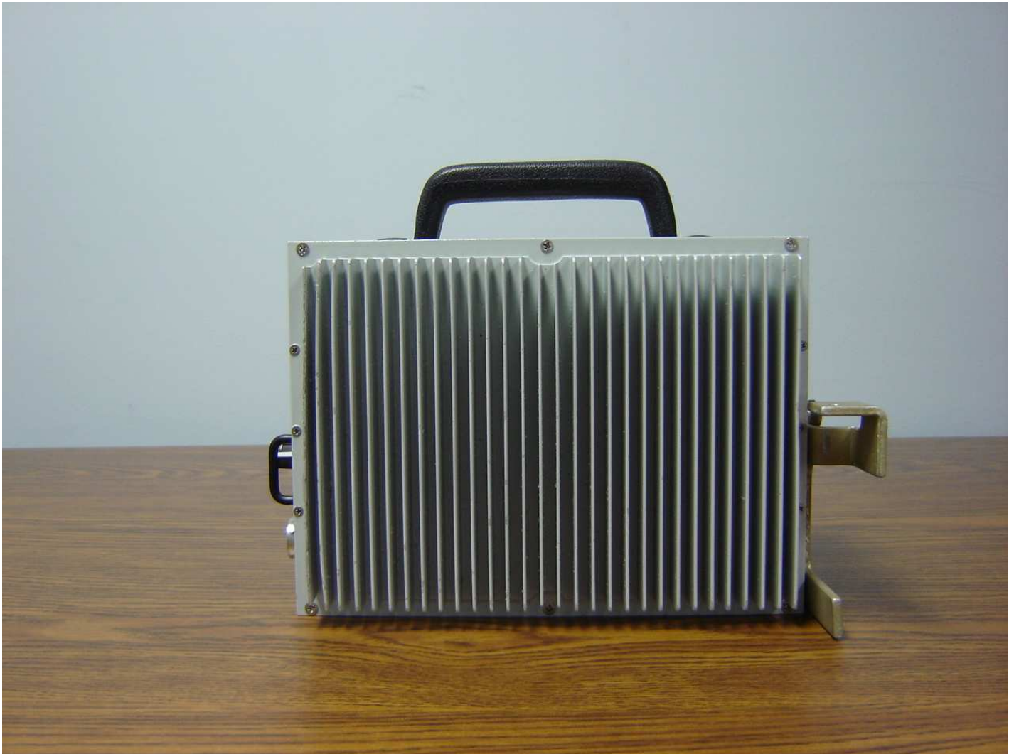
Figure 3: Right Side of Unit