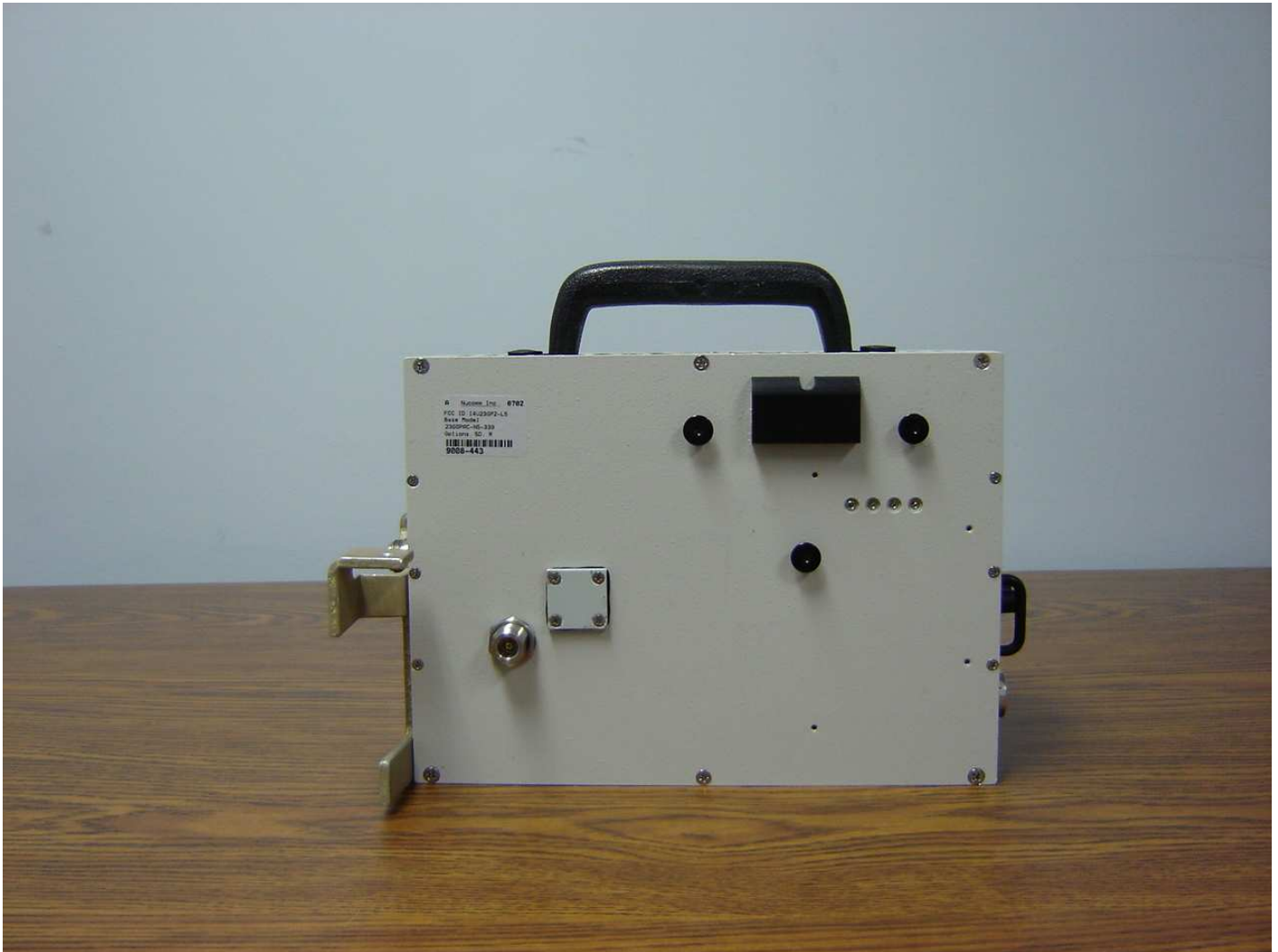
Figure 4: Left Side of Unit