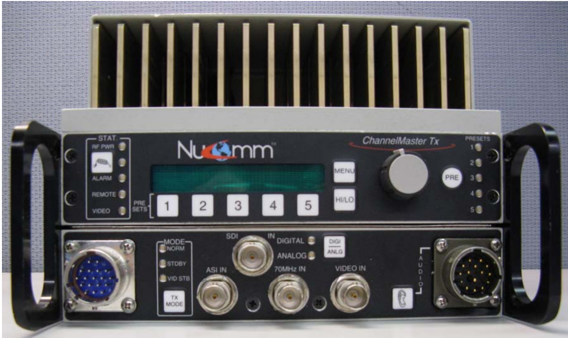
Photo 1 Front View