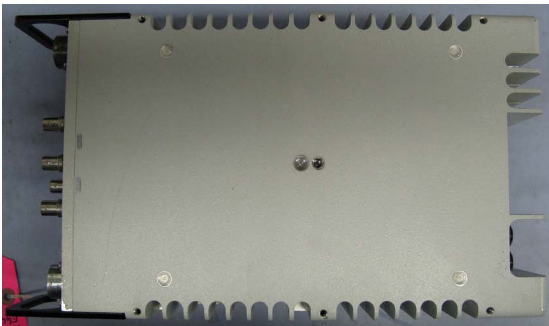
Photo 6 Bottom View