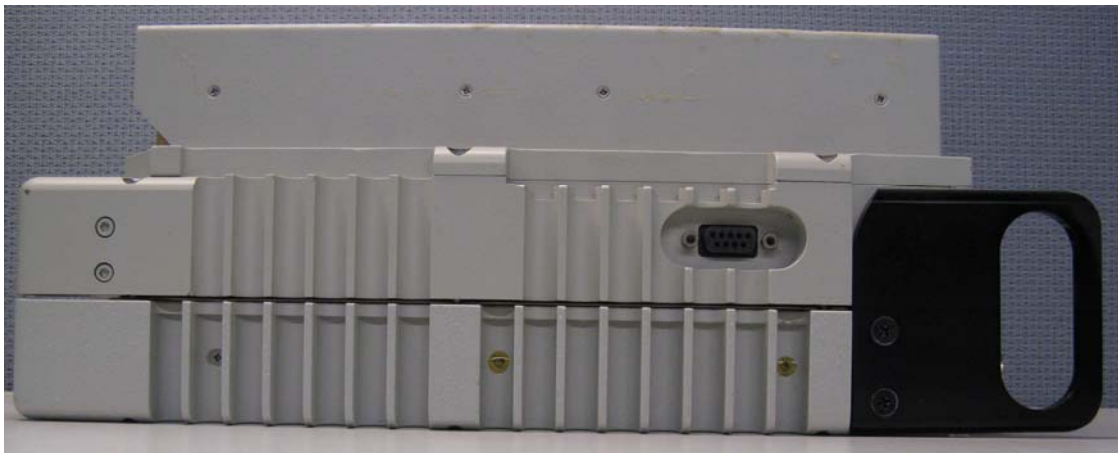
Photo 2 Left Side View