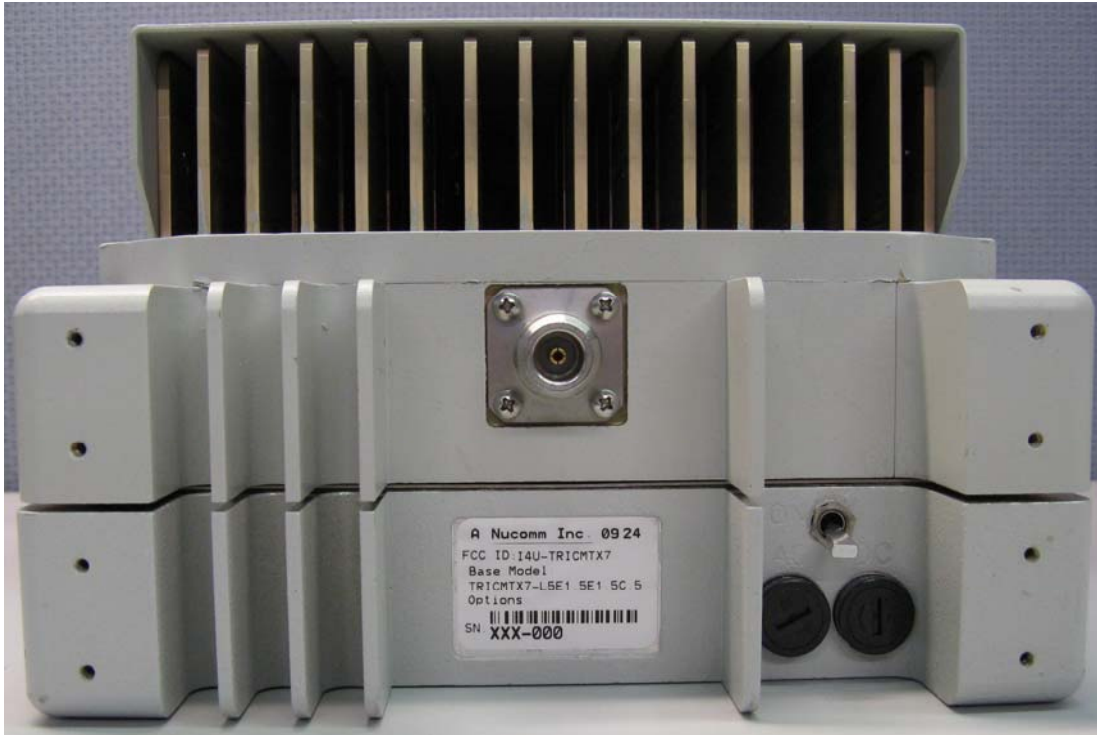
Photo 3 Back View