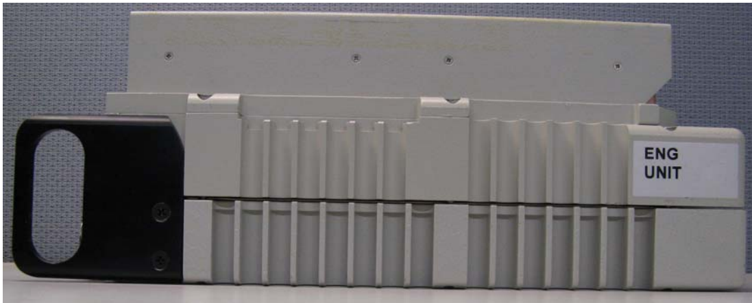
Photo 4 Right Side View