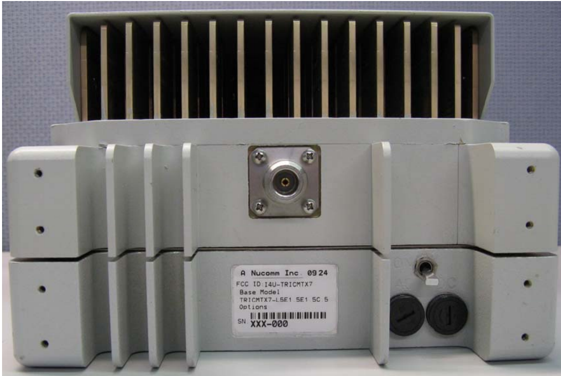
Photo 2 FCC ID Label Location