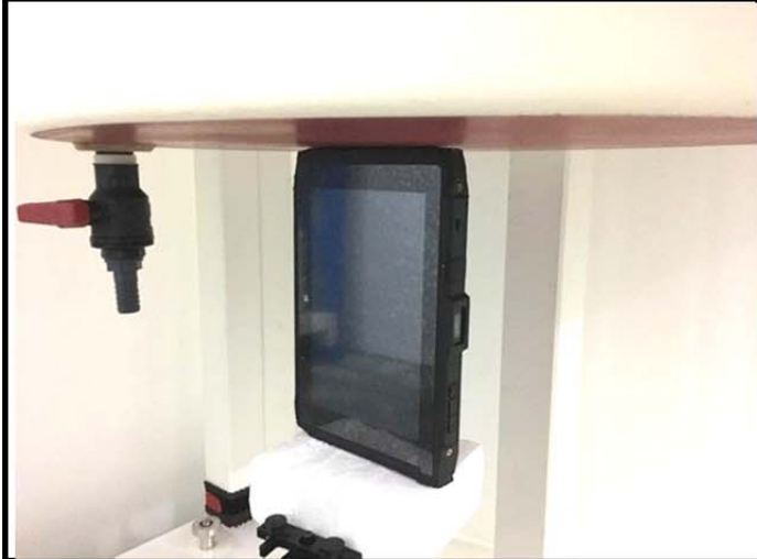
Left Side of EUT with 0 cm Gap