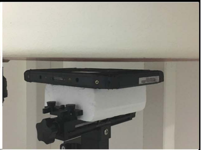
Rear Face of EUT with 1.5cm Gap