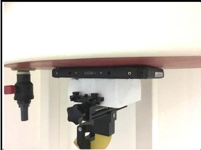
Rear Face of EUT with 0 cm Gap