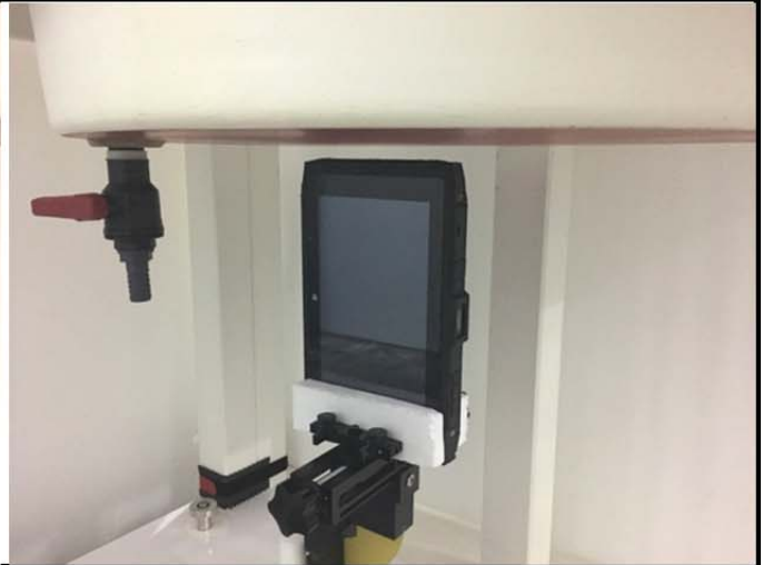
Right Side of EUT with 1 cm Gap