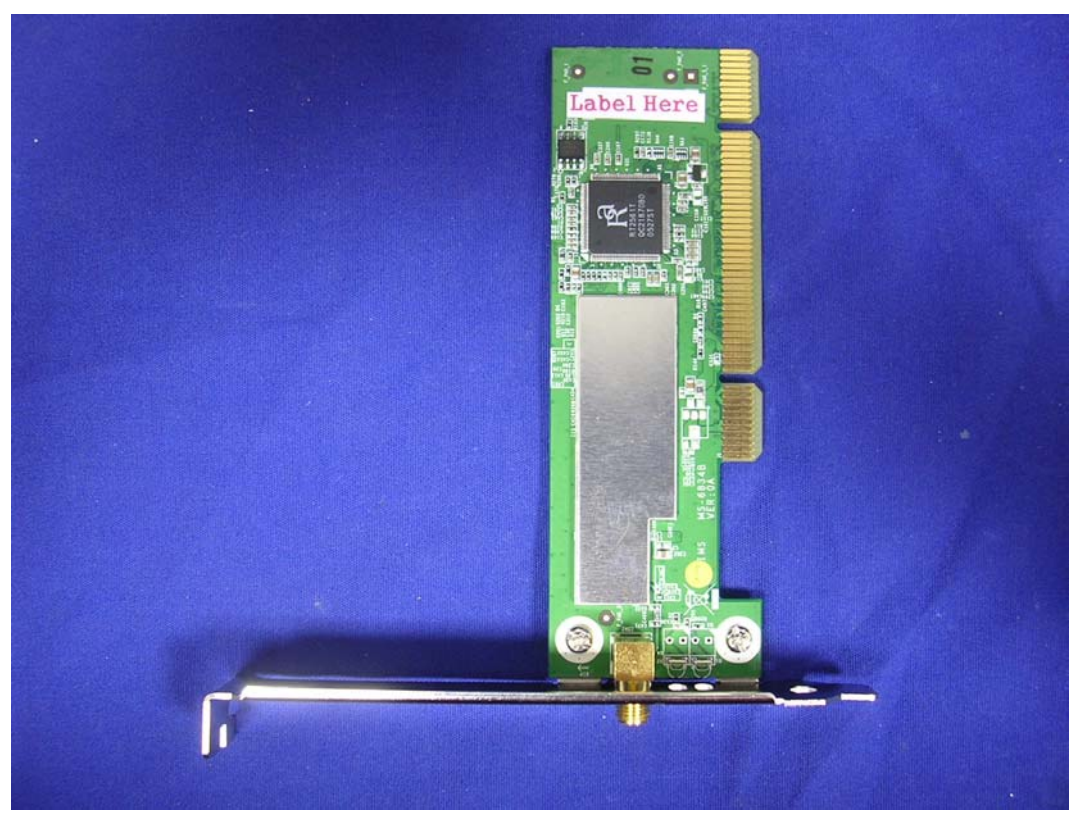
The FCC ID and DoC Label will be placed on the equipment as shown in the photograph below.