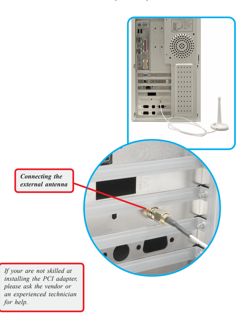
Step 4. Connect the external antenna to the connector on the PC11B2's (MS-6828) bracket.

Step 3. Replace the computer cover after securing the PC11B2 (MS-6828) with a bracket screw.