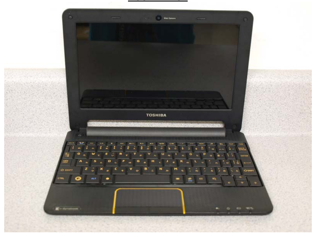
HOST DEVICE WITH ANTENNA LOCATION