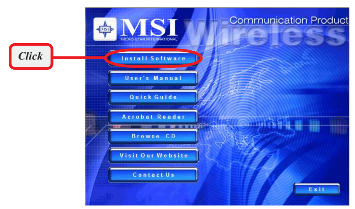
The installation screen of Setup program