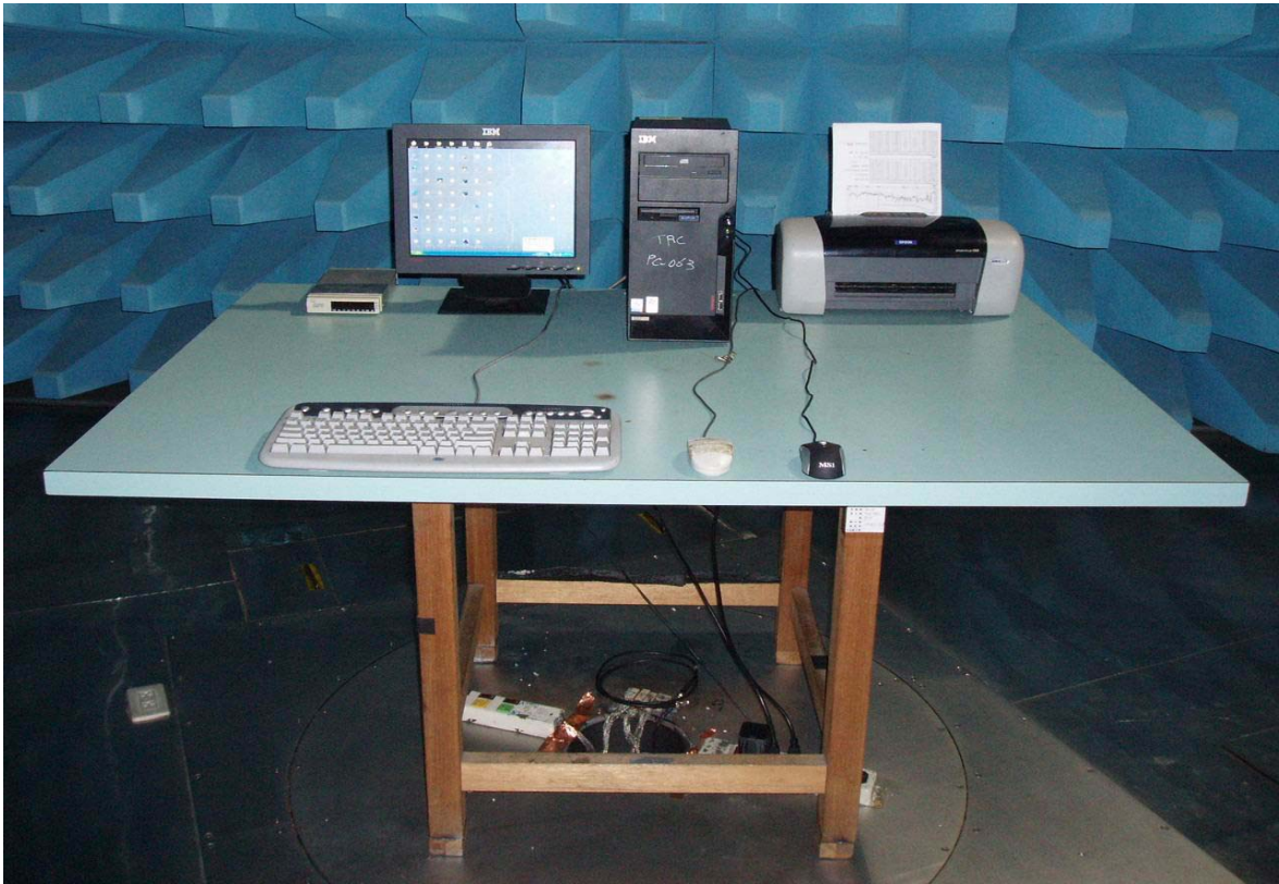
Front View of the Test Configuration