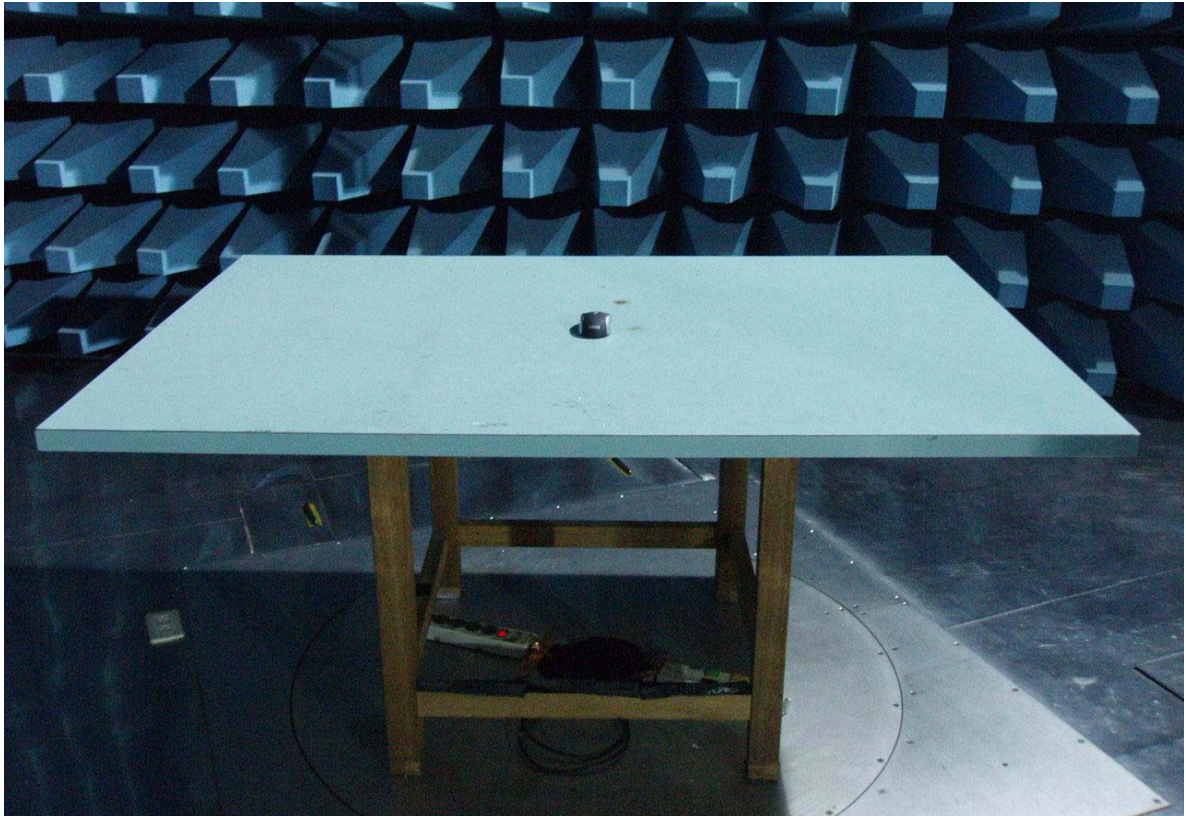
Front View of the Test Configuration