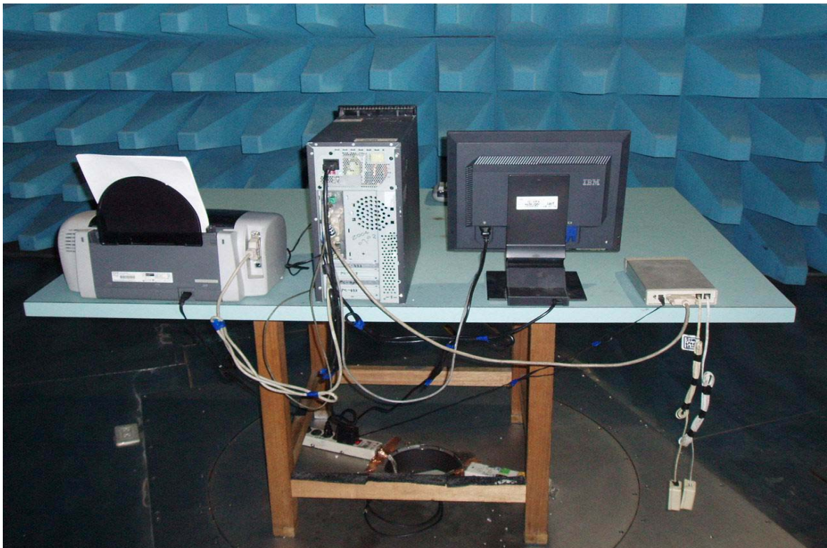
Rear View of the Test Configuration