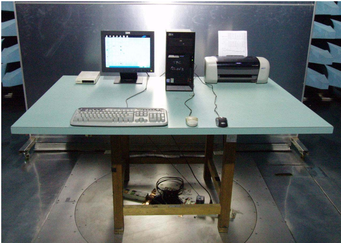
Front View of the Test Configuration