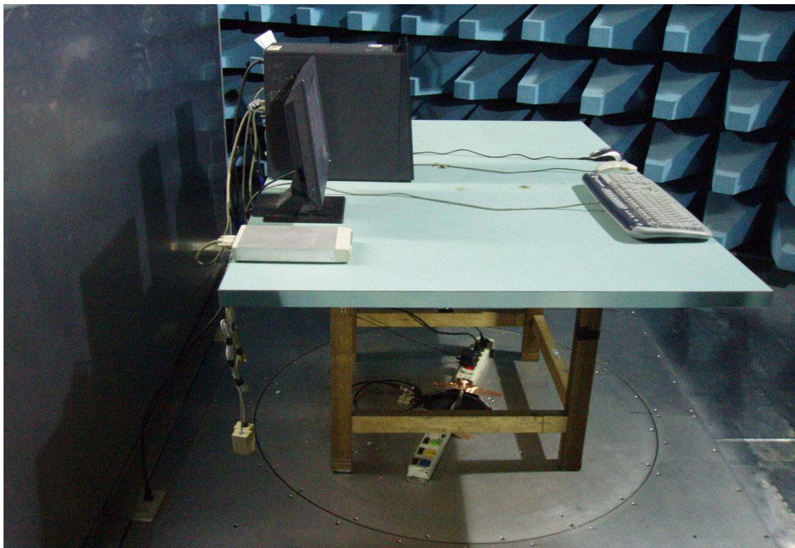
Side View of the Test Configuration