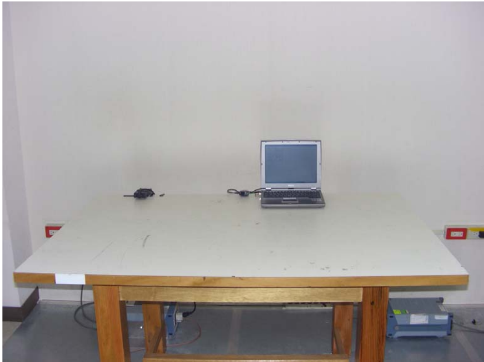
Back View of Conducted Test (USB Link PC)