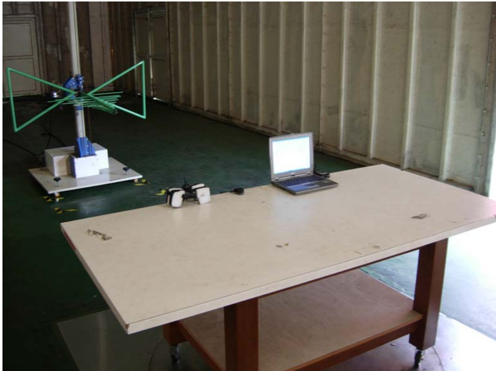
Back View of Radiated Test (Car Charge)