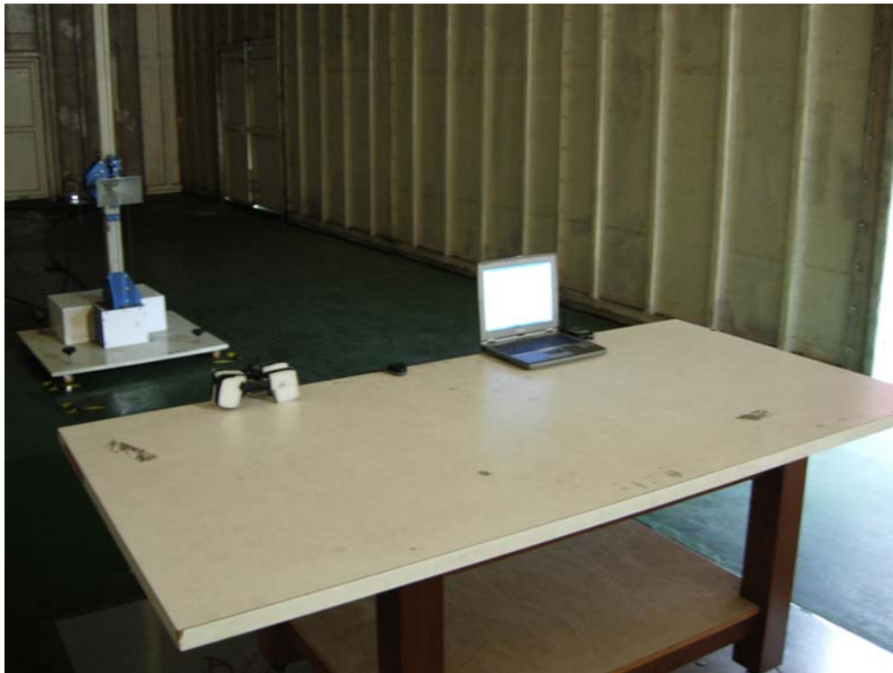
Back View of Radiated Test (Horn) (Car Charge)