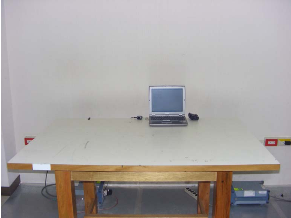
Back View of Conducted Test (AC adapter)