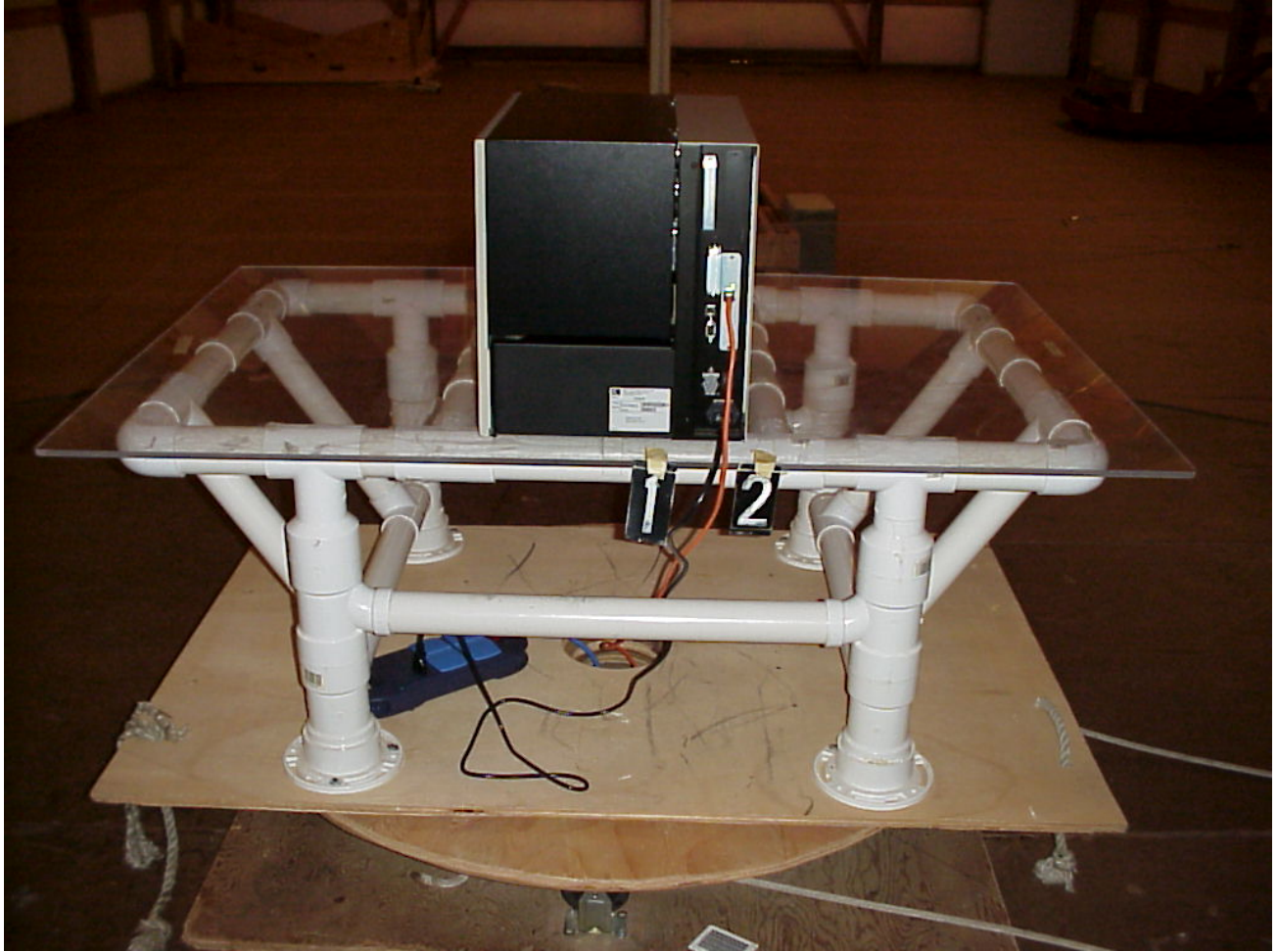
RADIATED EMISSIONS (BACK)