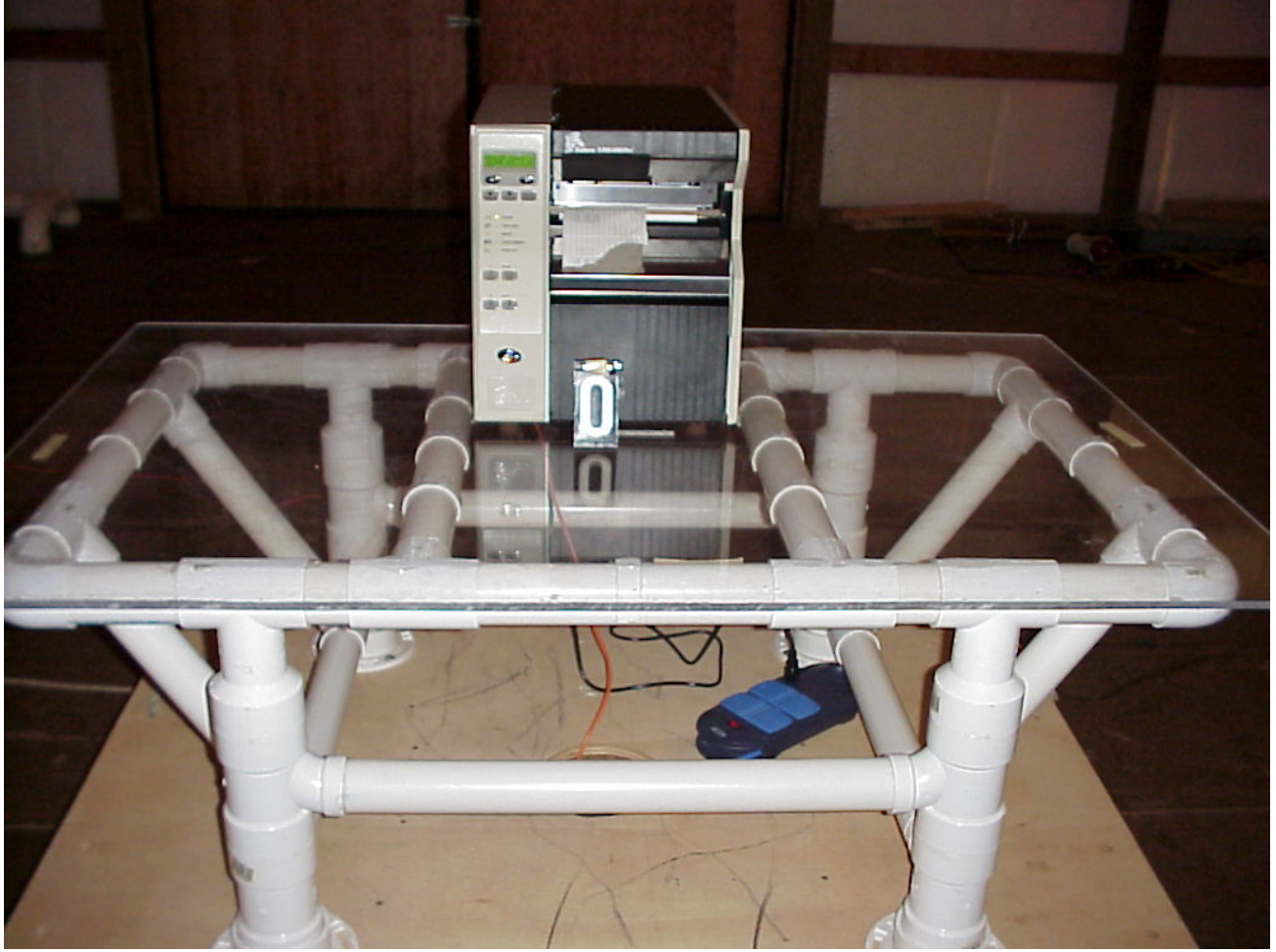
RADIATED EMISSIONS (FRONT)