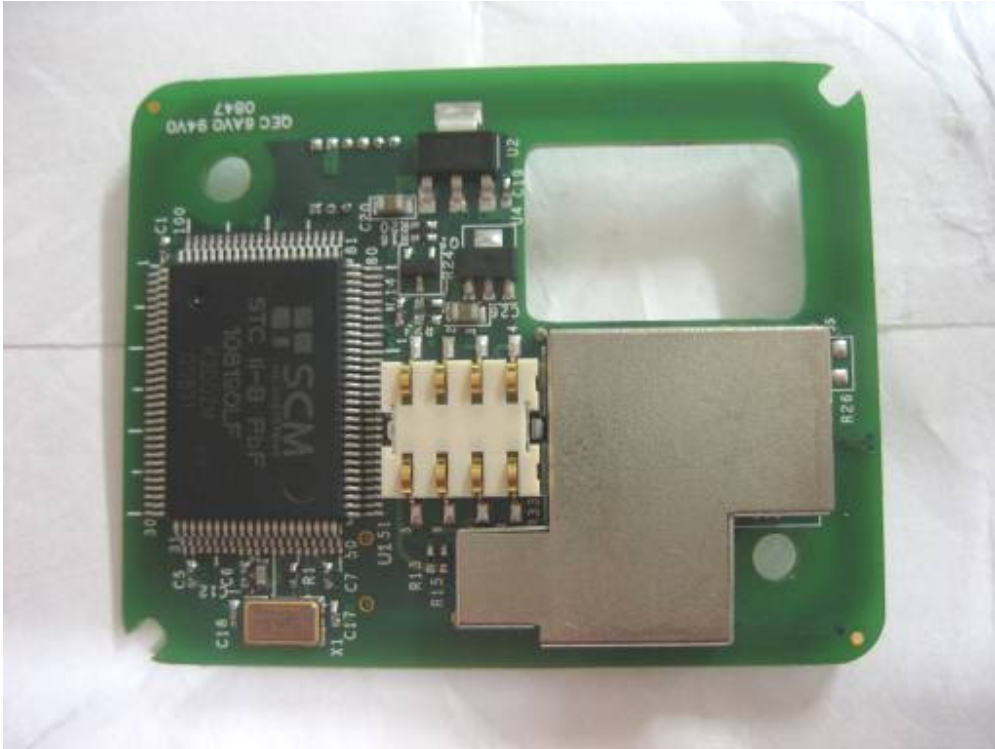
Contactless RFID Board with shielding -Bottom View