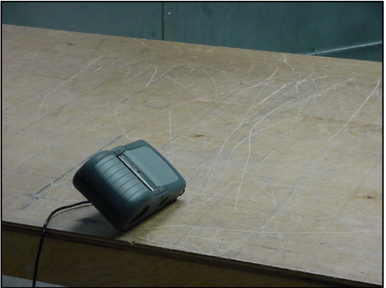
PHOTOGRAPH 6: CONDUCTED EMISSION REAR VIEW