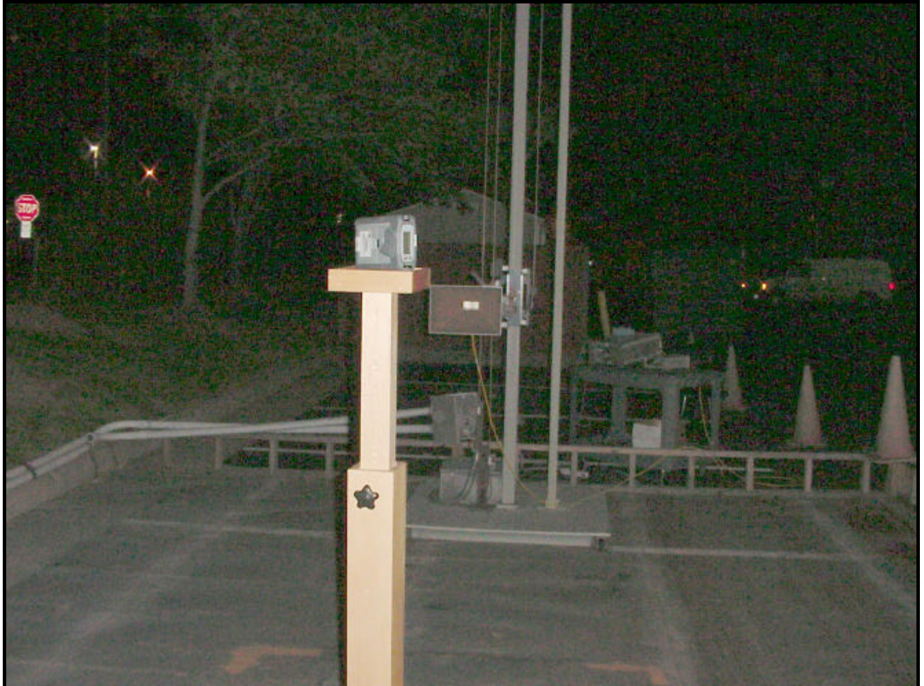
PHOTOGRAPH 3: RADIATED EMISSION FRONT VIEW