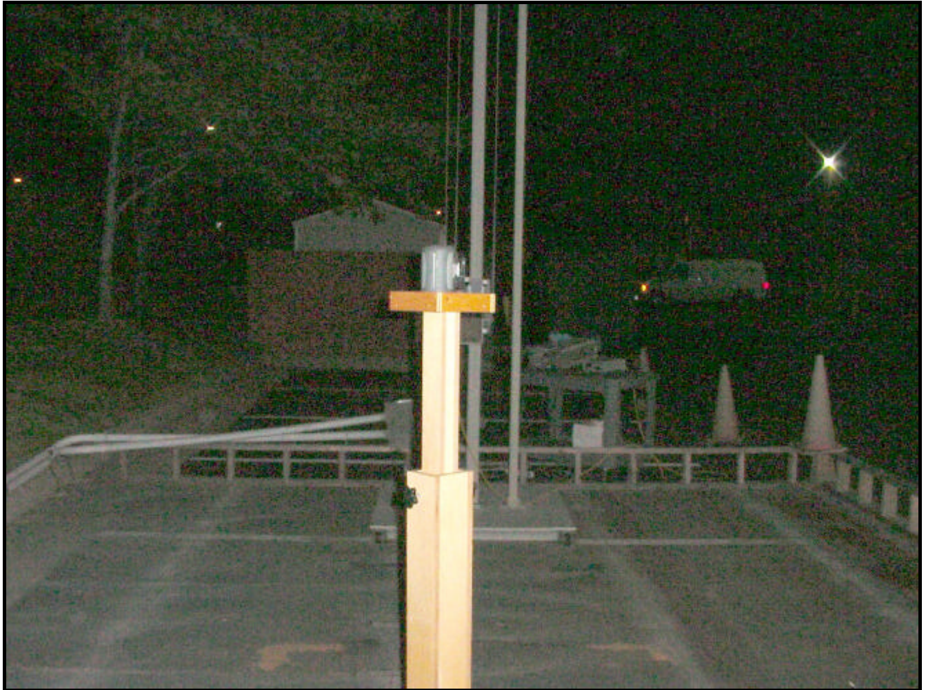
PHOTOGRAPH 4: RADIATED EMISSION REAR VIEW