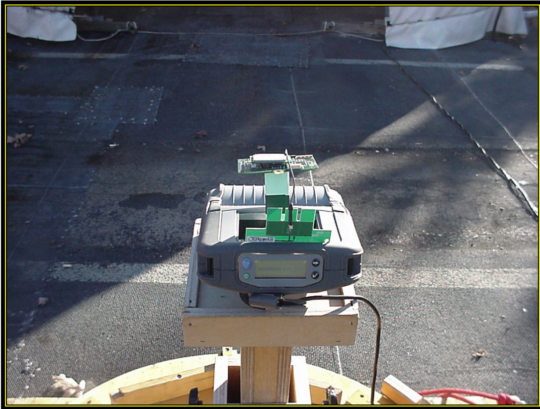
Photograph 3: Radiated Emissions - Front View of CQ17718-G2 Antenna Testing