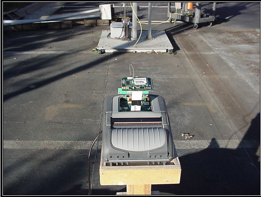
Photograph 2: Radiated Emissions - Rear View of CQ17718-G1 Antenna Testing