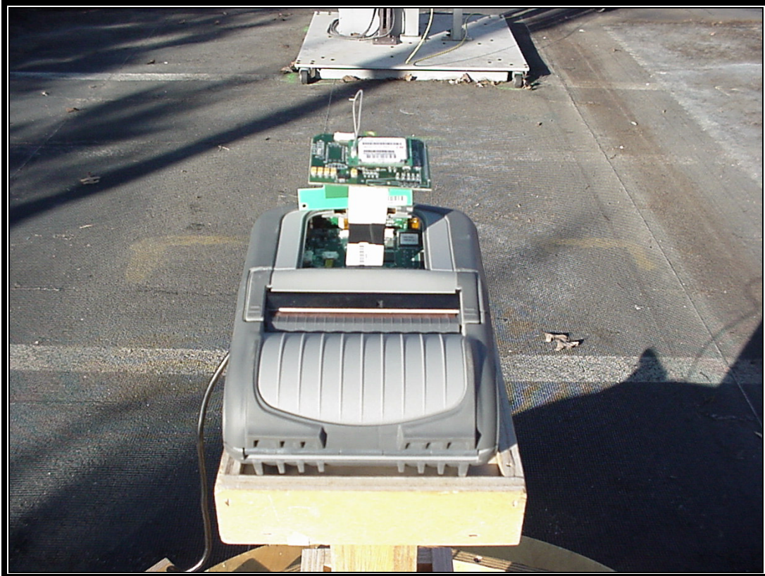
Photograph 4: Radiated Emissions - Rear View of CQ17718-G2 Antenna Testing