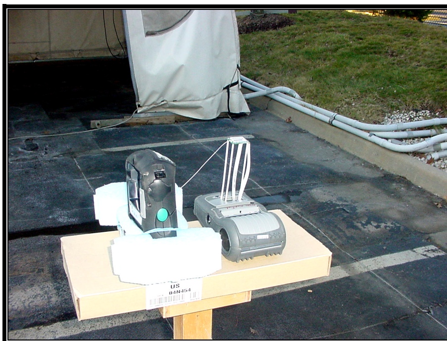
PHOTOGRAPH 8: RADIATED EMISSIONS REAR VIEW USING RW-420 CQ17252-1 ANTENNA