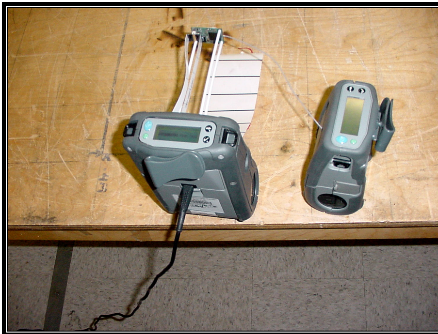
PHOTOGRAPH 10: CONDUCTED EMISSIONS REAR VIEW USING QL-220 CQ17383-1 ANTENNA