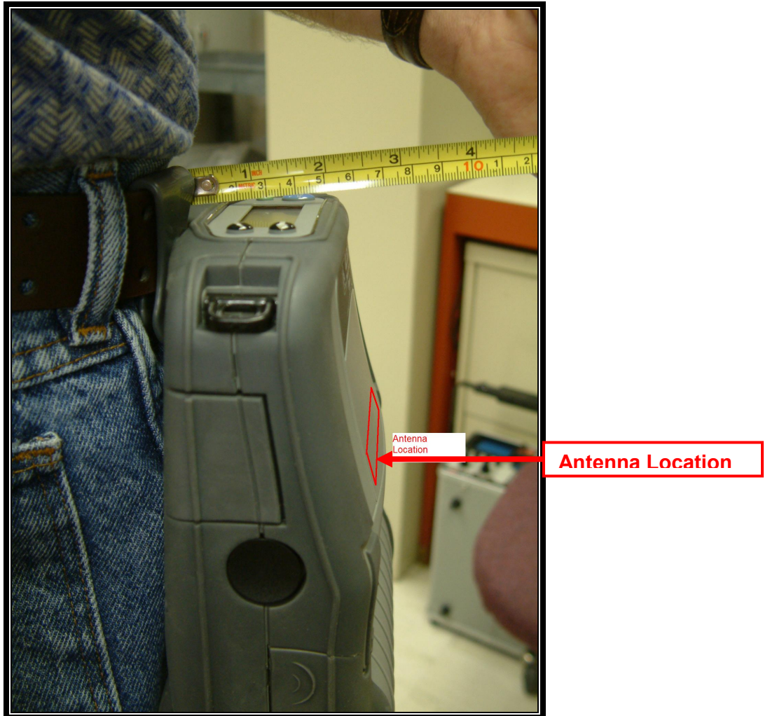
Photograph 4: QL420 side view showing separation distance between antenna and body