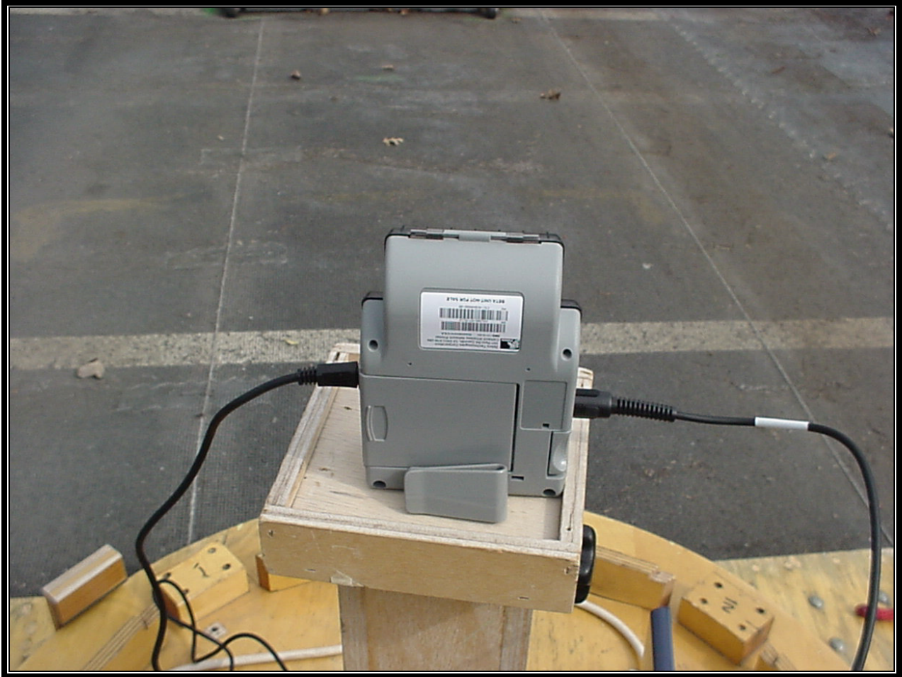
Photograph 2: Radiated Testing – Back View