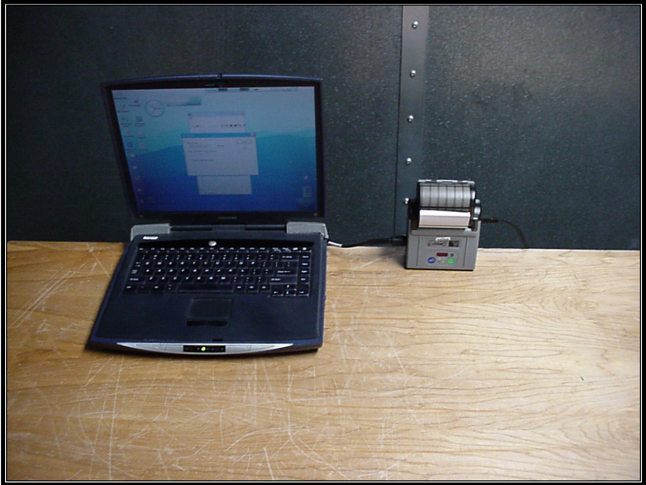
Photograph 3: Conducted AC Testing – Front View