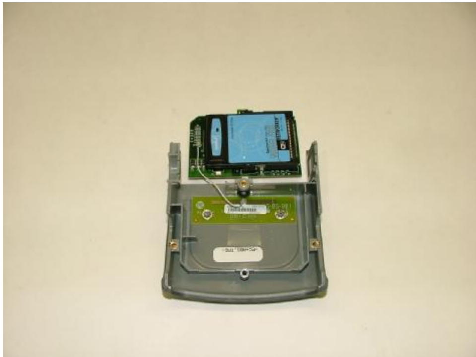
RF Carrier Board with H9PLA4137 and I28MD-BTC2TY4 Installed