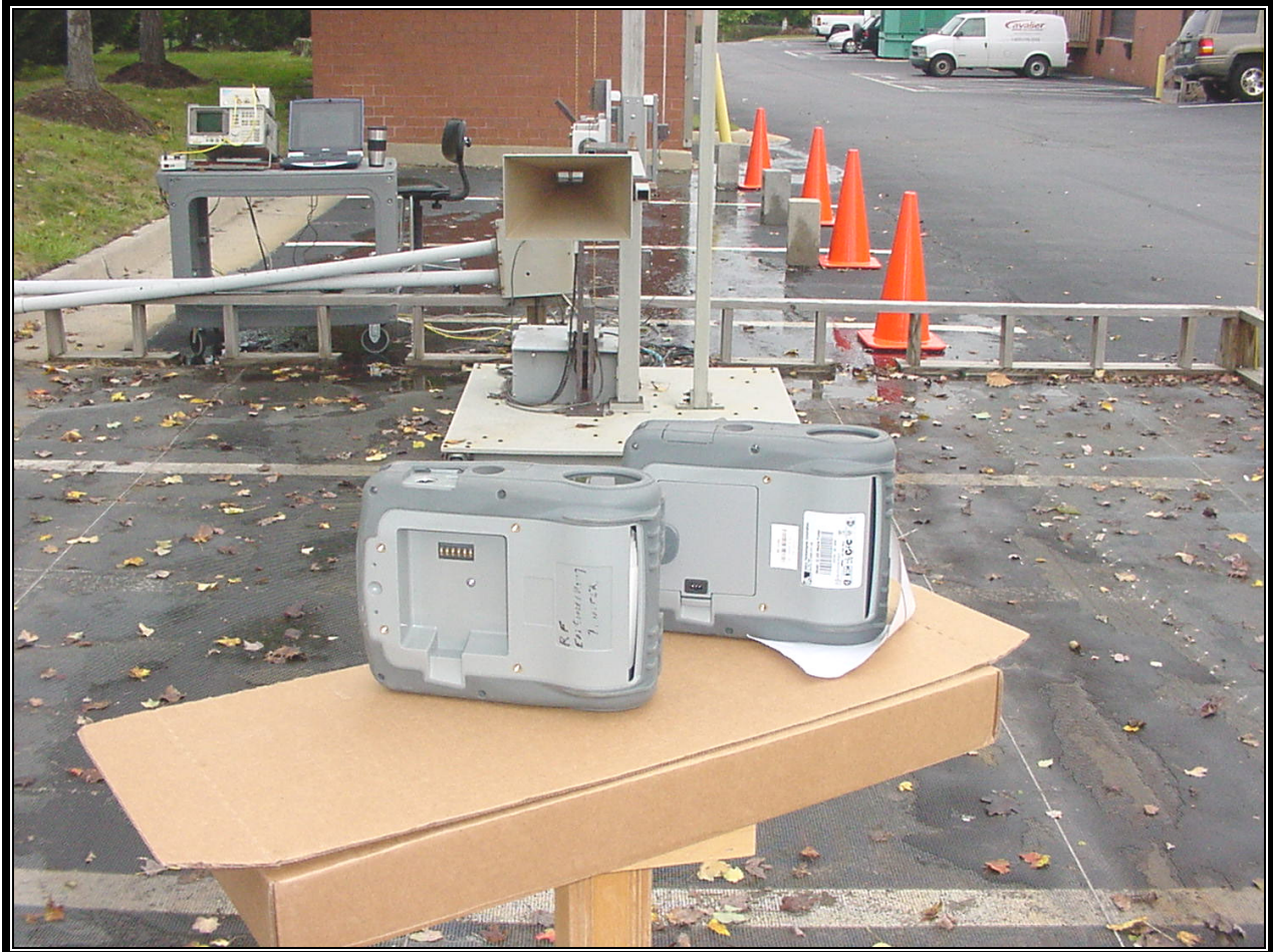
PHOTOGRAPH 17: RADIATED EMISSION REAR VIEW, WORST CASE CONFIGURATION QL FAMILY SECOND GENERATION BLUETOOTH (CQ17383-1) ANTENNA

Client: Zebra Technologies Corp. Model Name/ #: ZBR-3/EYSF2CAXX FCC ID: I28MD-BTC2TY2 FCC: 15.247 IC: RSS-210