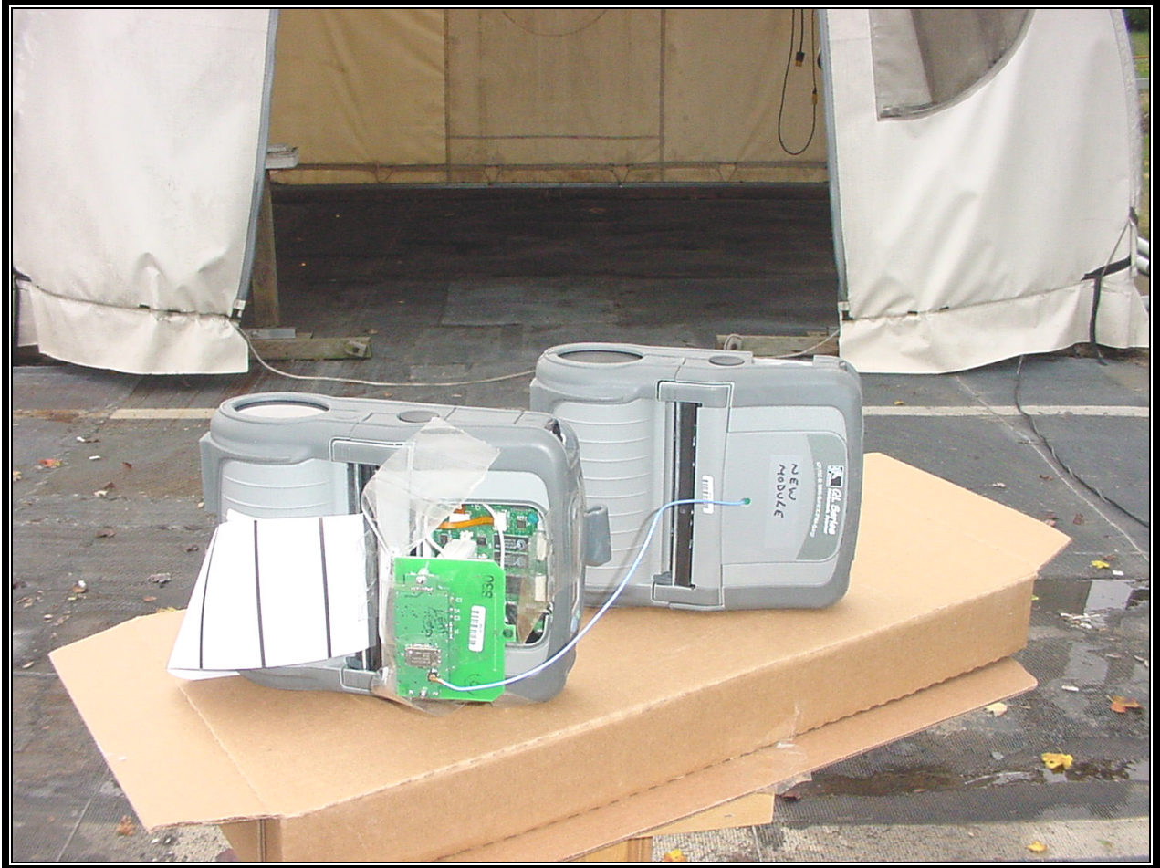
PHOTOGRAPH 16: RADIATED EMISSION FRONT VIEW, WORST CASE CONFIGURATION QL FAMILY SECOND GENERATION BLUETOOTH (CQ17383-1) ANTENNA

Client: Zebra Technologies Corp. Model Name/#: ZBR-3/EYSF2CAXX FCC ID: I28MD-BTC2TY2 FCC: 15.247 IC: RSS-210