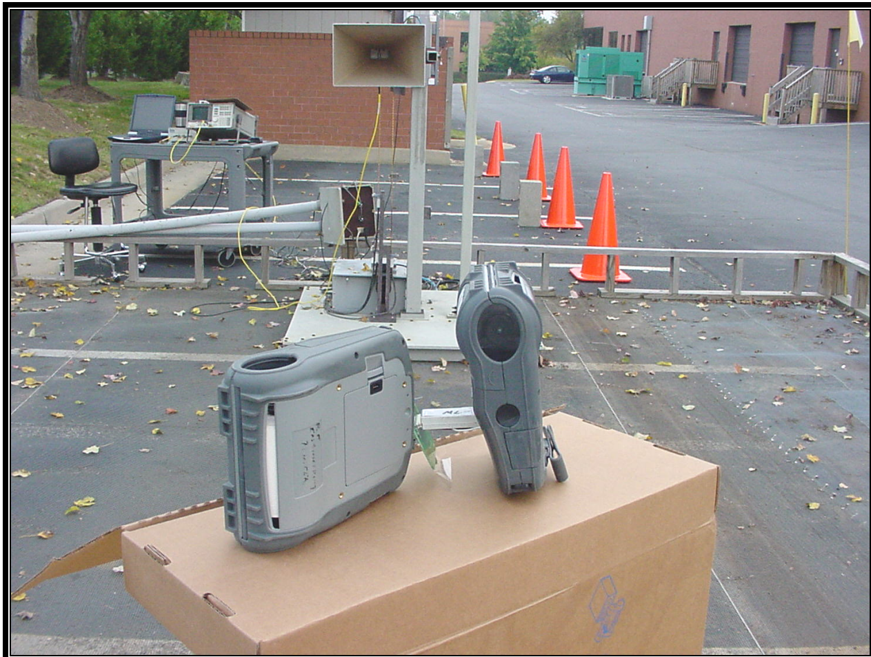
PHOTOGRAPH 13: RADIATED EMISSION REAR VIEW, WORST CASE CONFIGURATION QL FAMILY (CC16203-2) ANTENNA

Client: Zebra Technologies Corp. Model Name/#: ZBR-3/EYSF2CAXX FCC ID: I28MD-BTC2TY2 FCC: 15.247 IC: RSS-210