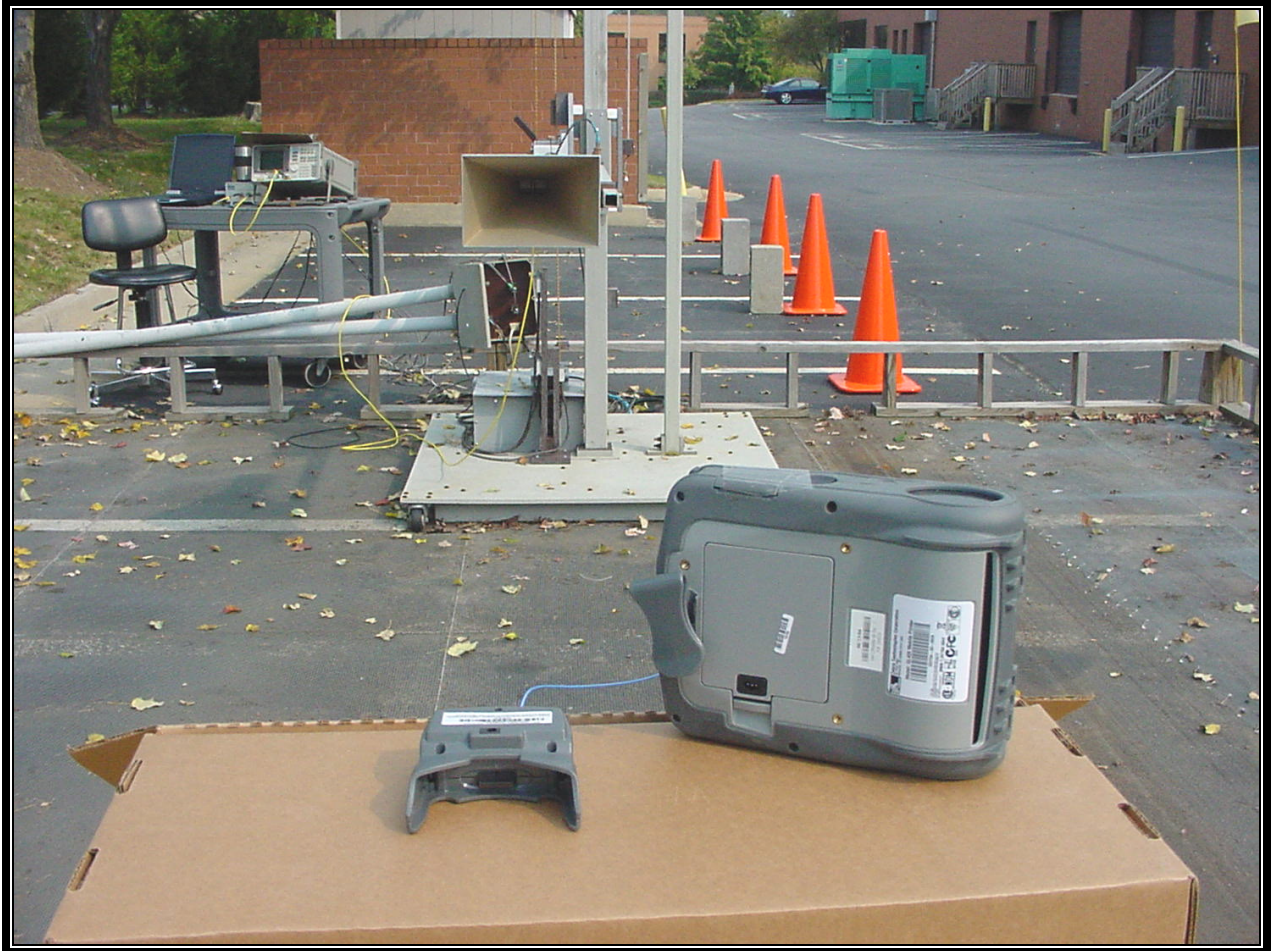
PHOTOGRAPH 15: RADIATED EMISSION REAR VIEW, WORST CASE CONFIGURATION ZPR MODULE (CQ15813-1) ANTENNA