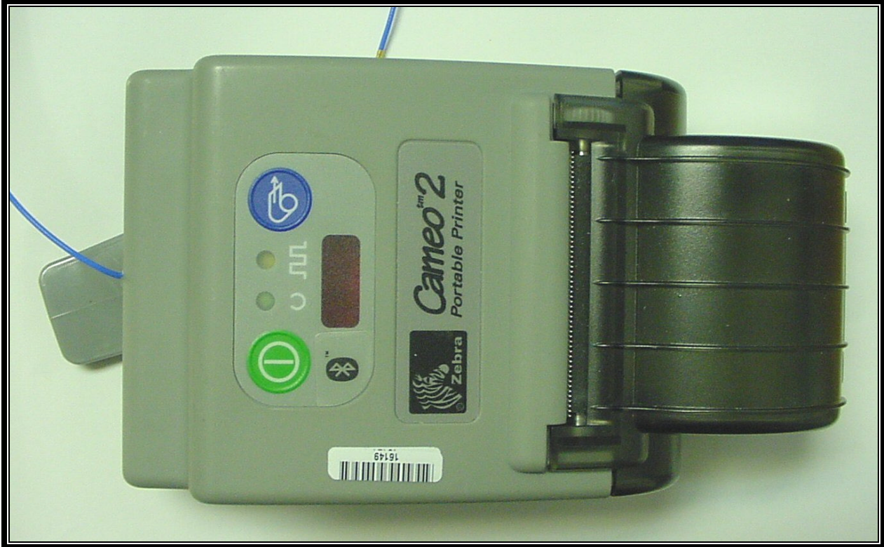
PHOTOGRAPH 22: TOP VIEW CAMEO 2 ANTENNA INSTALLED IN TYPICAL HOST

Client: Zebra Technologies Corp. Model Name/#: ZBR-3/EYSF2CAXX FCC ID: I28MD-BTC2TY2 FCC: 15.247 IC: RSS-210