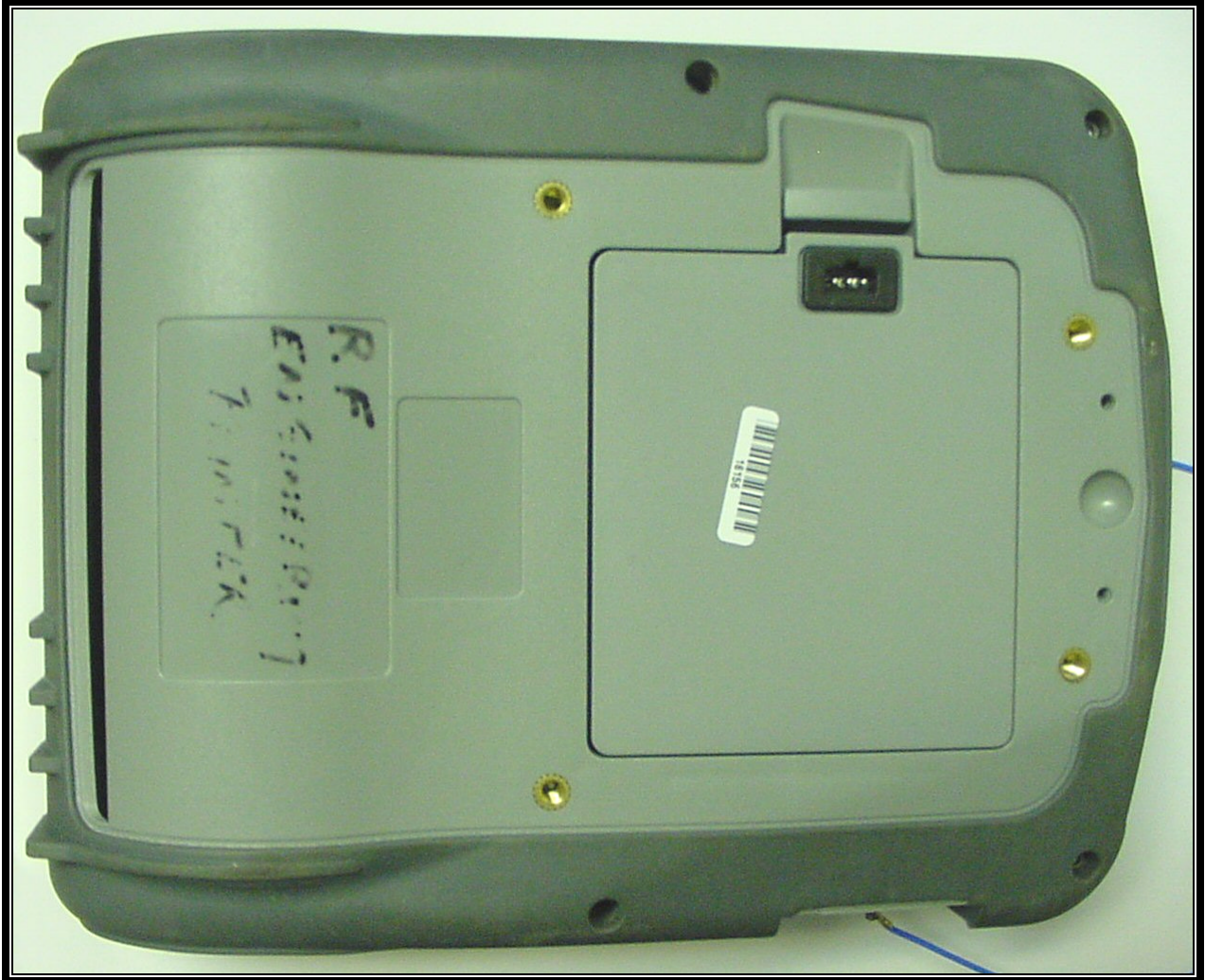
PHOTOGRAPH 25: REAR VIEW QL-420 ANTENNA INSTALLED IN TYPICAL HOST

Client: Zebra Technologies Corp. Model Name/ #: ZBR-3/EYSF2CAXX FCC ID: I28MD-BTC2TY2 FCC: 15.247 IC: RSS-210