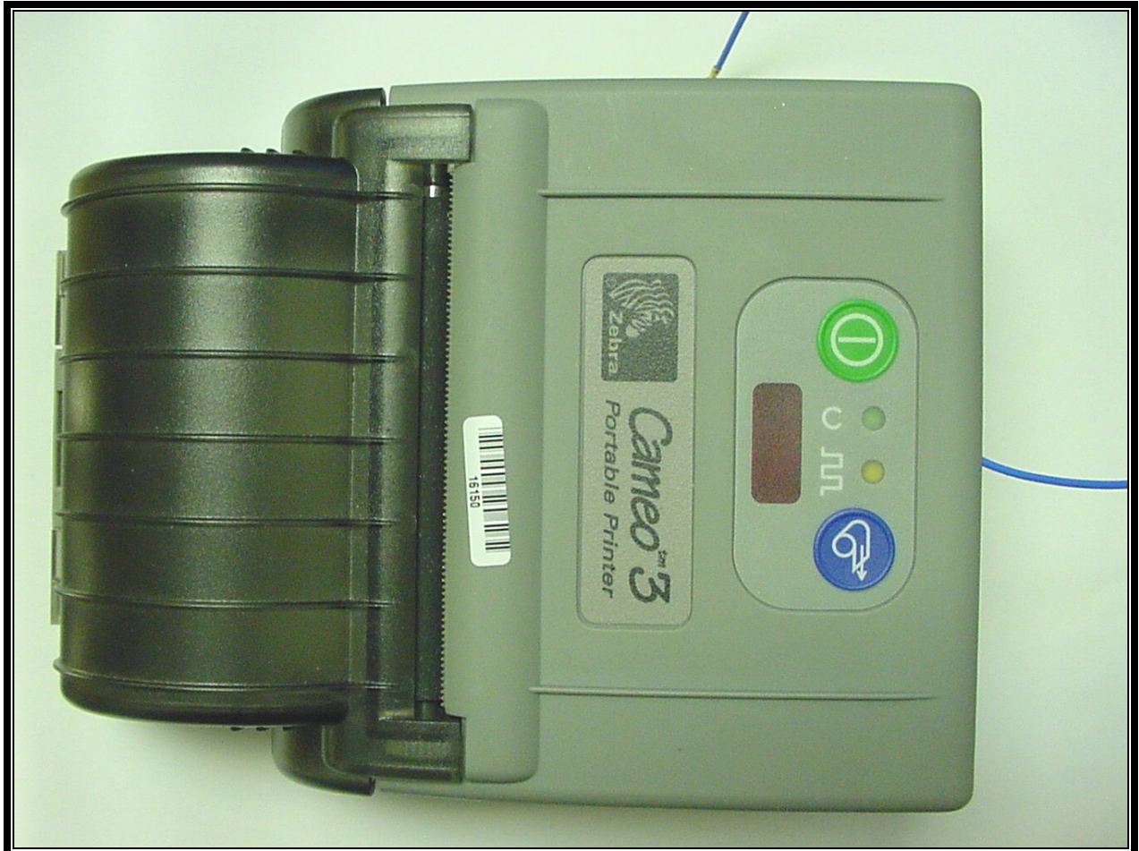
PHOTOGRAPH 20: TOP VIEW CAMEO 3 ANTENNA INSTALLED IN TYPICAL HOST