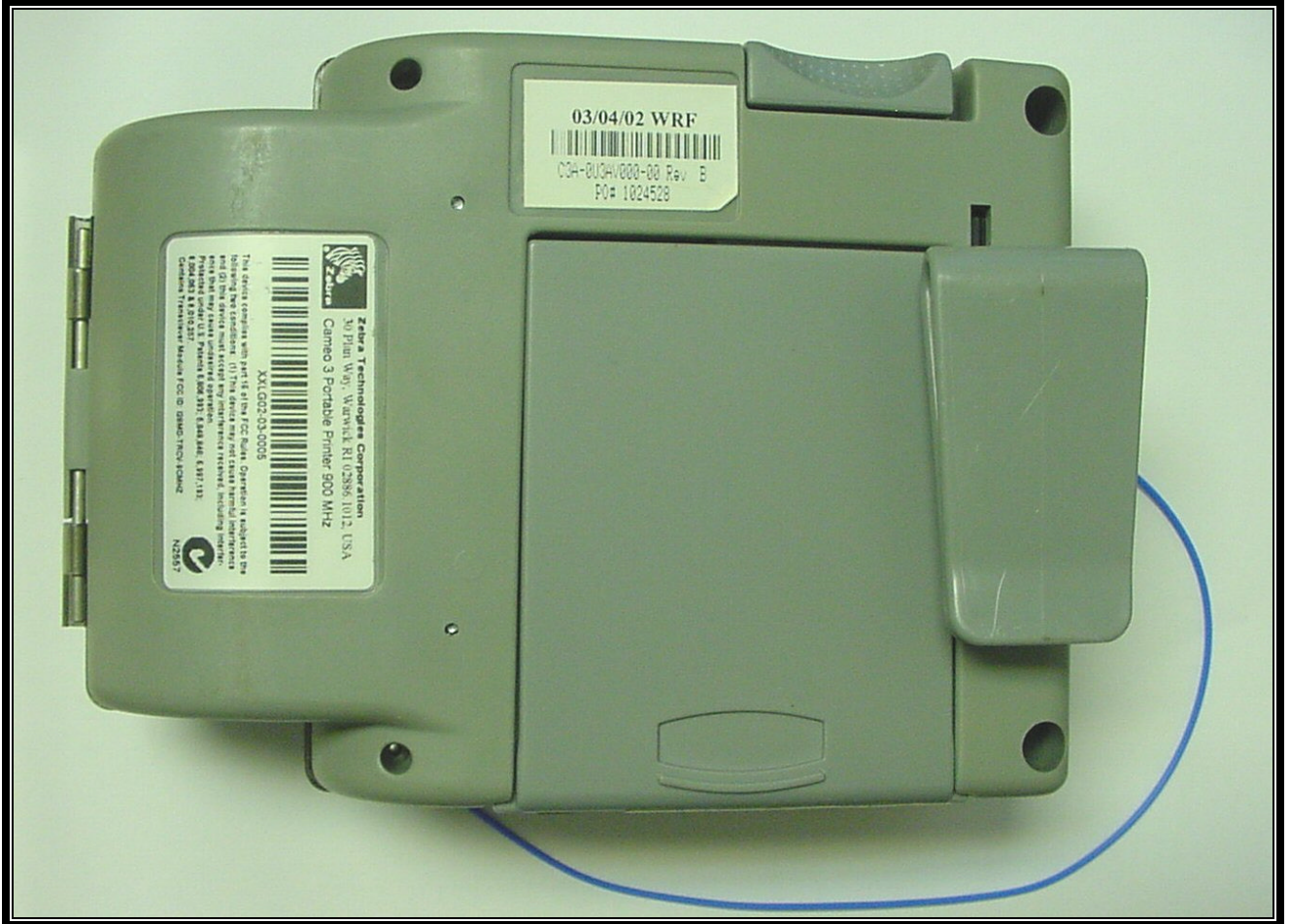
PHOTOGRAPH 21: REAR VIEW CAMEO 3 ANTENNA INSTALLED IN TYPICAL HOST

Client: Zebra Technologies Corp. Model Name/#: ZBR-3/EYSF2CAXX FCC ID: I28MD-BTC2TY2 FCC: 15.247 IC: RSS-210