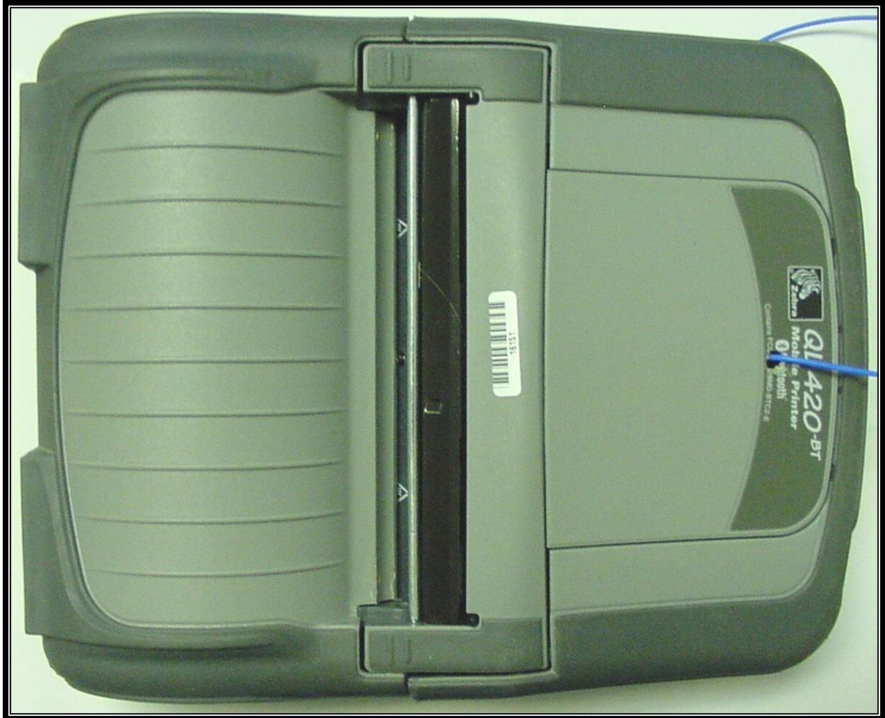
PHOTOGRAPH 24: FRONT VIEW QL-420 ANTENNA INSTALLED IN TYPICAL HOST

Client: Zebra Technologies Corp. Model Name/#: ZBR-3/EYSF2CAXX FCC ID: I28MD-BTC2TY2 FCC: 15.247 IC: RSS-210