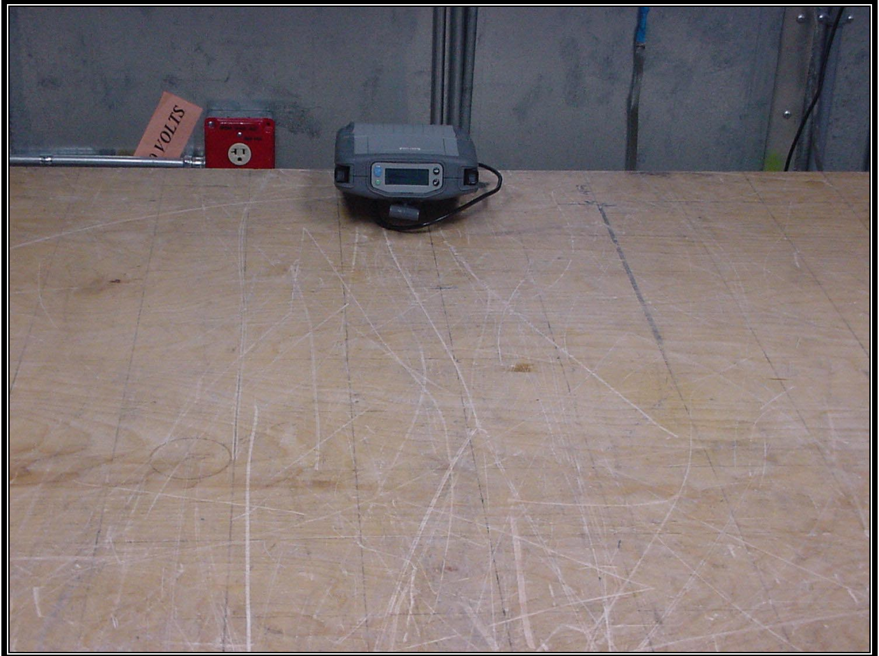
PHOTOGRAPH 3: CONDUCTED EMISSION FRONT VIEW