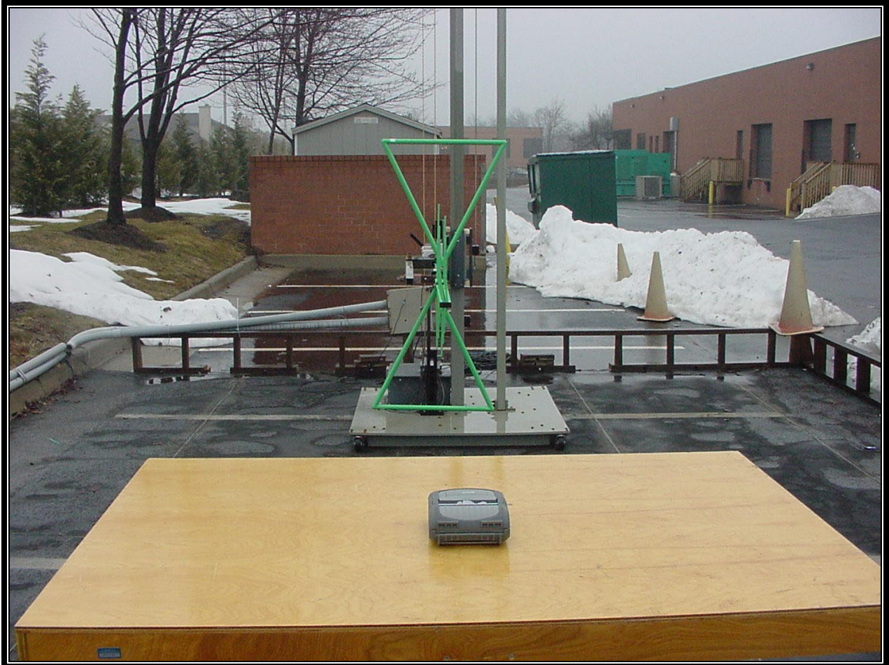
PHOTOGRAPH 2: RADIATED EMISSION REAR VIEW