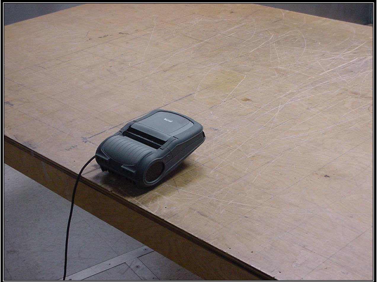
PHOTOGRAPH 4: CONDUCTED EMISSION REAR VIEW