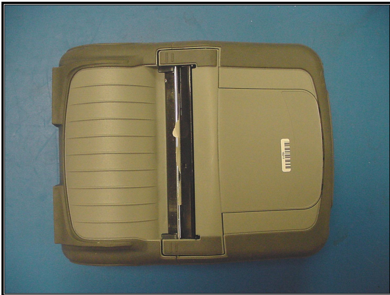
PHOTOGRAPH 3: TOP OF EUT

Client: Zebra Technologies FCC/IC: Part 15.247/RSS-210 RTL WO#: 2003123/2003124 FCC ID: I28-PL4352 M/N: PL4