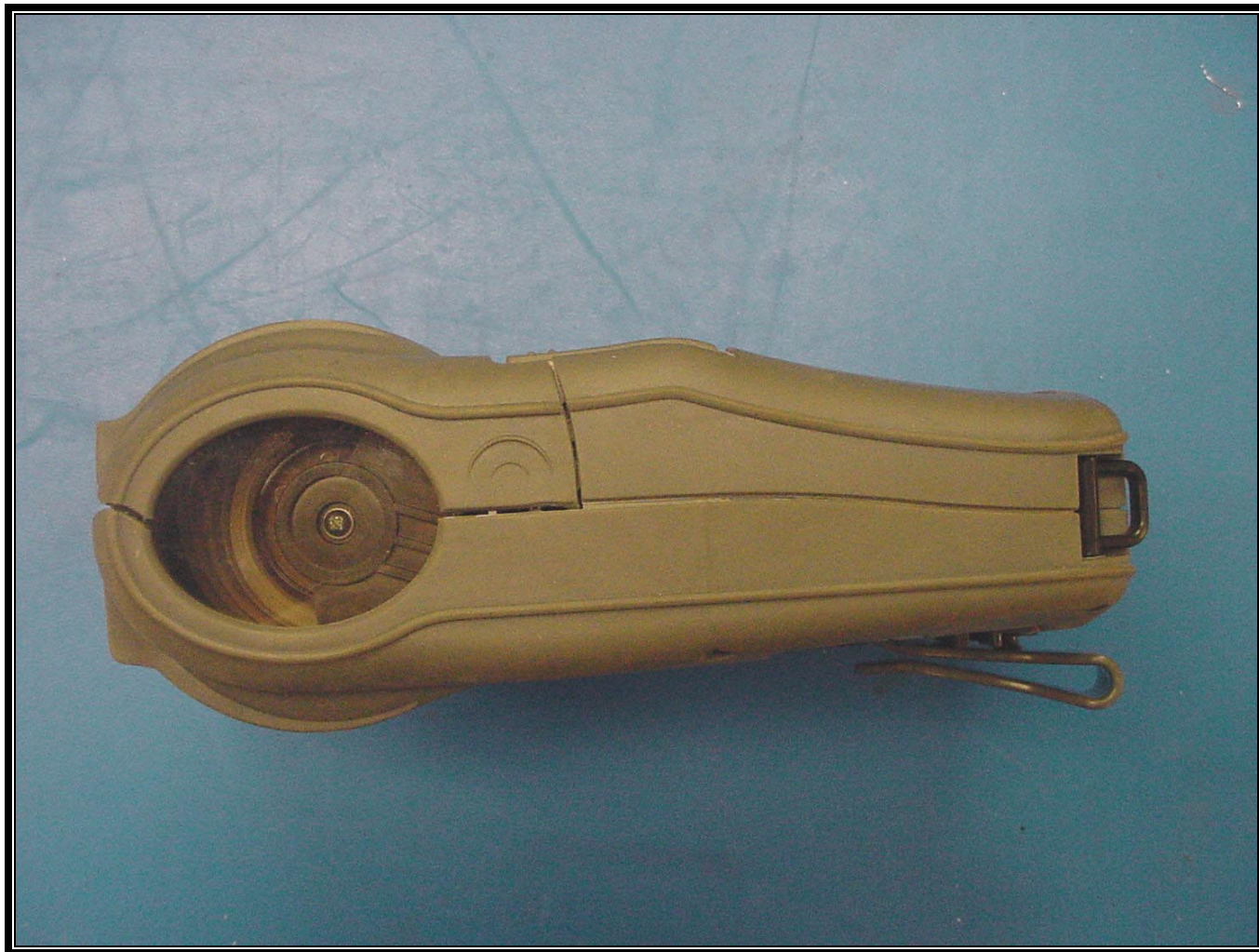
PHOTOGRAPH 5: RIGHT SIDE OF EUT

Client: Zebra Technologies FCC/IC: Part 15.247/RSS-210 RTL WO#: 2003123/2003124 FCC ID: I28-PL4352 M/N: PL4