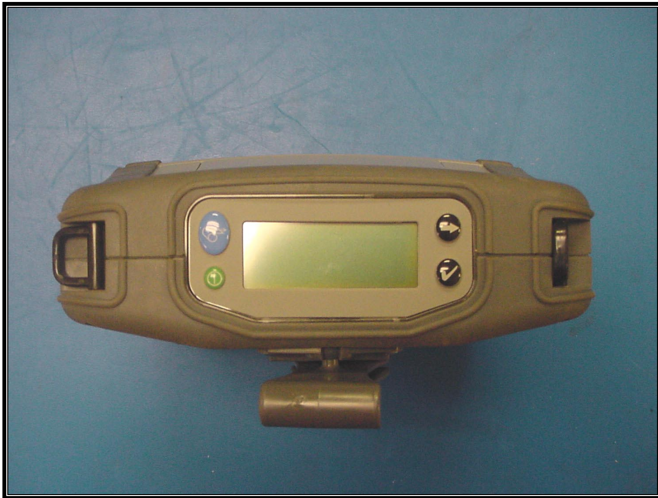
PHOTOGRAPH 1: FRONT OF EUT