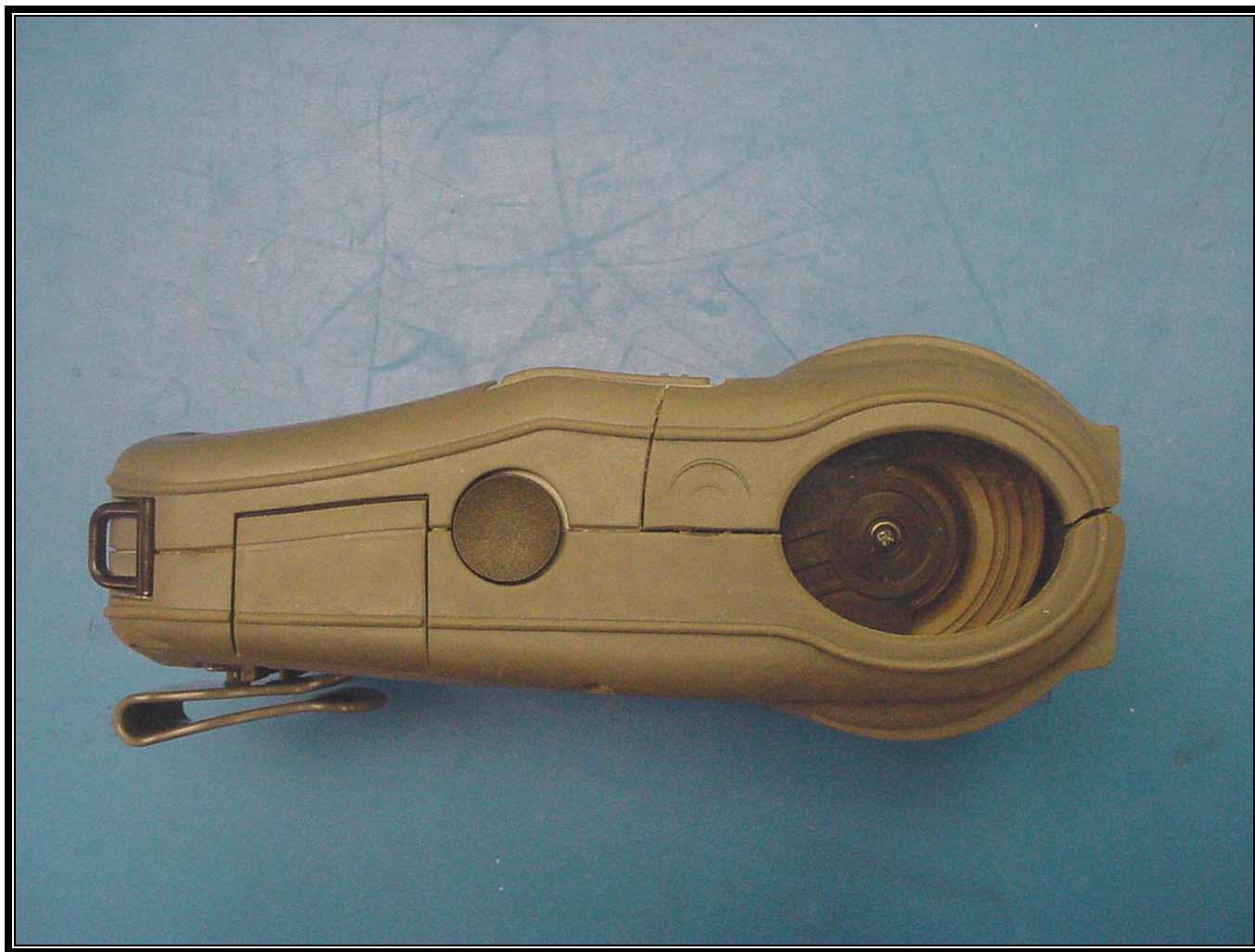
PHOTOGRAPH 4: LEFT SIDE OF EUT

Client: Zebra Technologies FCC/IC: Part 15.247/RSS-210 RTL WO#: 2003123/2003124 FCC ID: I28-PL4352 M/N: PL4