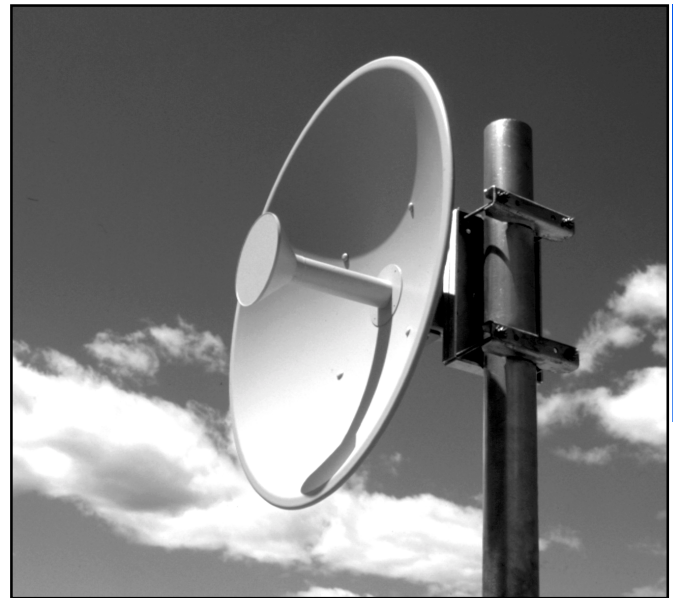
Gabriel "UNII" and "ISM" Band 2-ft. (0.6 m) - Plane Polarized - Standard Parabolic Antenna