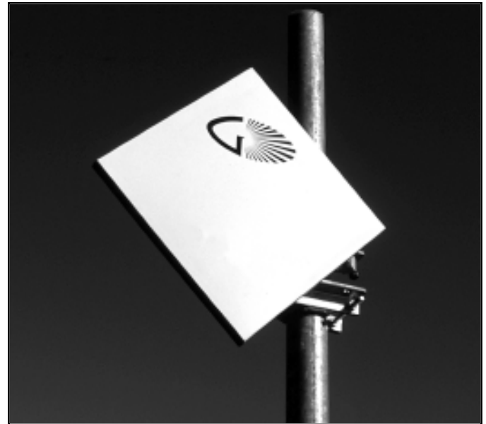
5 GHz Directional Flat Panel Antenna