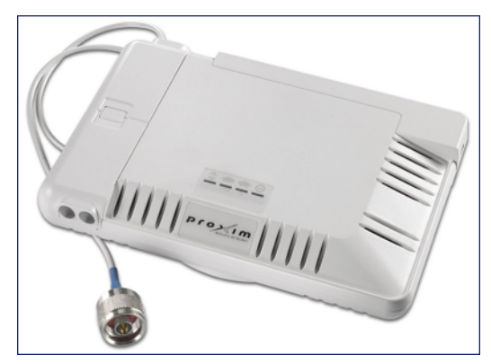
Figure F-3 AP-4900M External Antenna Connection

For a list of recommended antennas, see http://www.proxim.com/products/wifi/accessories.