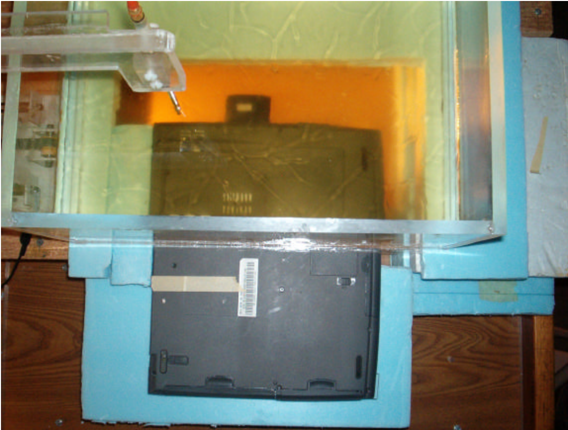
Fig 5. A close-up photograph corresponding to Fig.5 of the SAR report, i.e. for the Proxim Europe B.V. Model 8460-05 Cardbus Card inserted into a laptop computer with its bottom pressed against the bottom of the planar tissue-simulant phantom to simulate “above-lap” placement of the wireless PC.