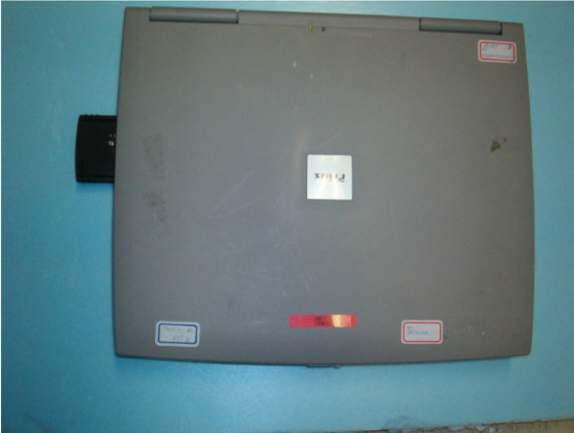
Fig A Photograph of the top cover of the host computer used in 5 GHz SAR tests made by PRIUS Company