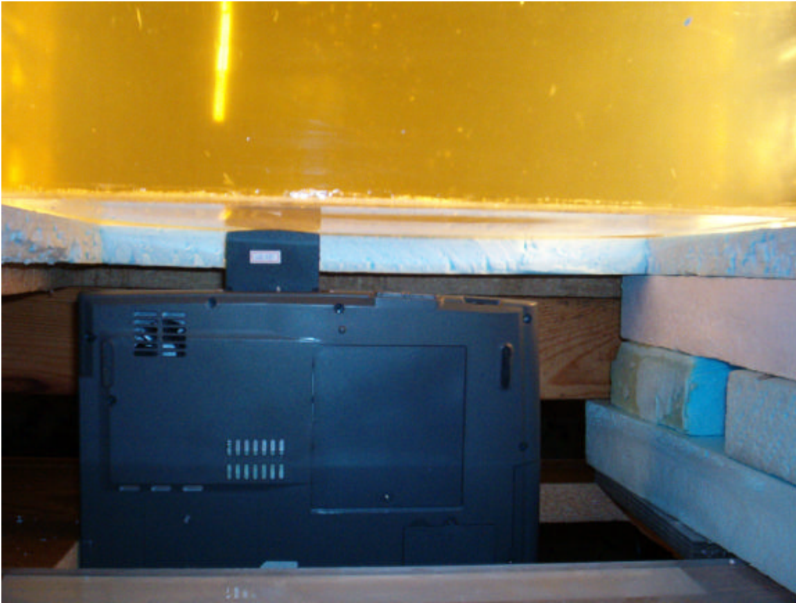
Fig.6a: Side view of the Proxim Europe B.V. Model 8460-05 Cardbus Card inserted into a laptop placed with the card edge at 90^{\circ} and separated from the bottom of the phantom by 0 cm for “end-on” testing of SAR.