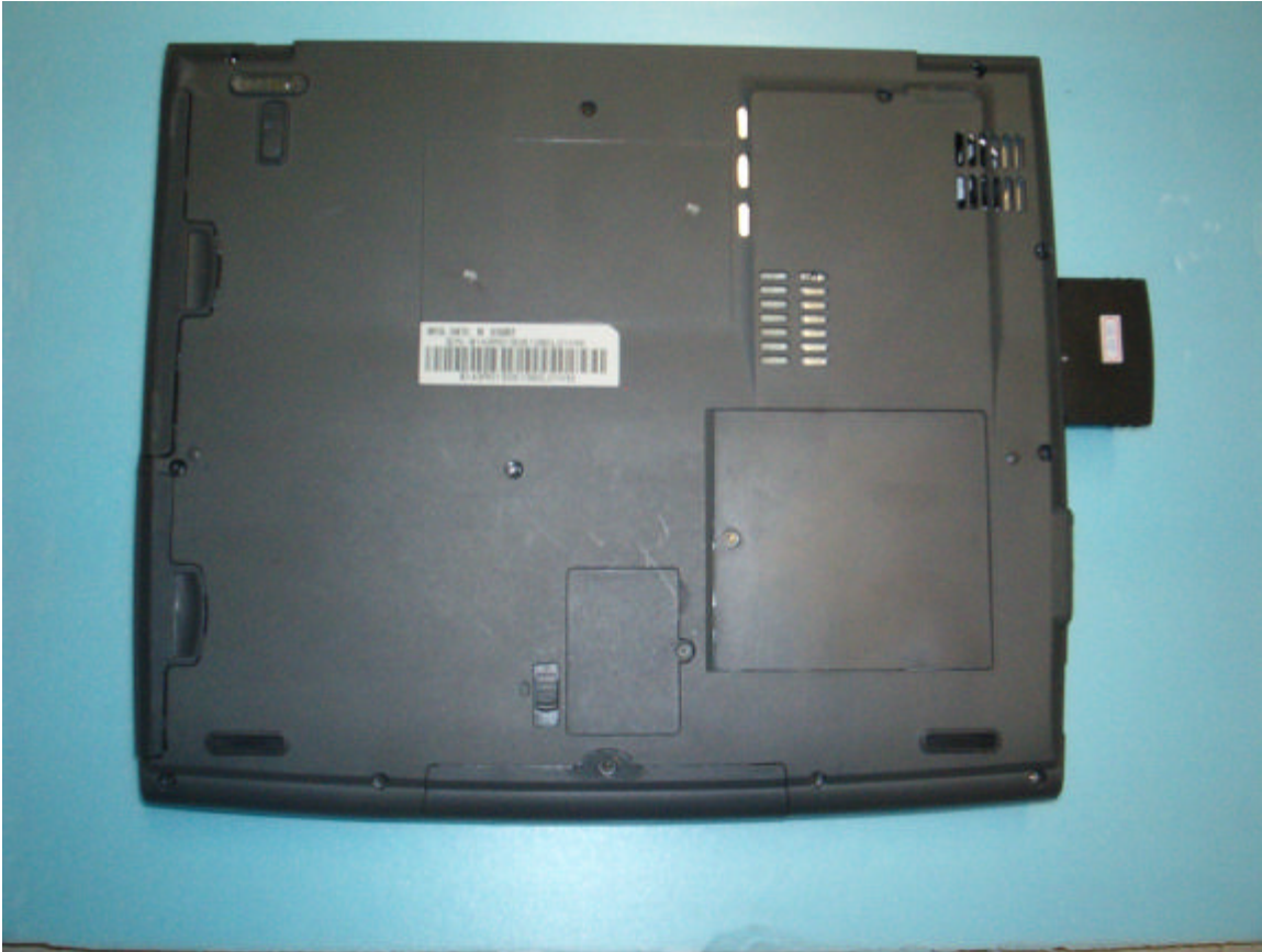
Fig B Photograph of the bottom of the host computer used in 5 GHz SAR tests made by PRIUS Company