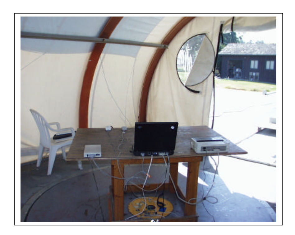
Page 31 of 32