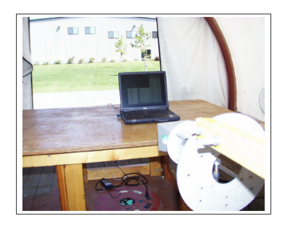
Page 30 of 32